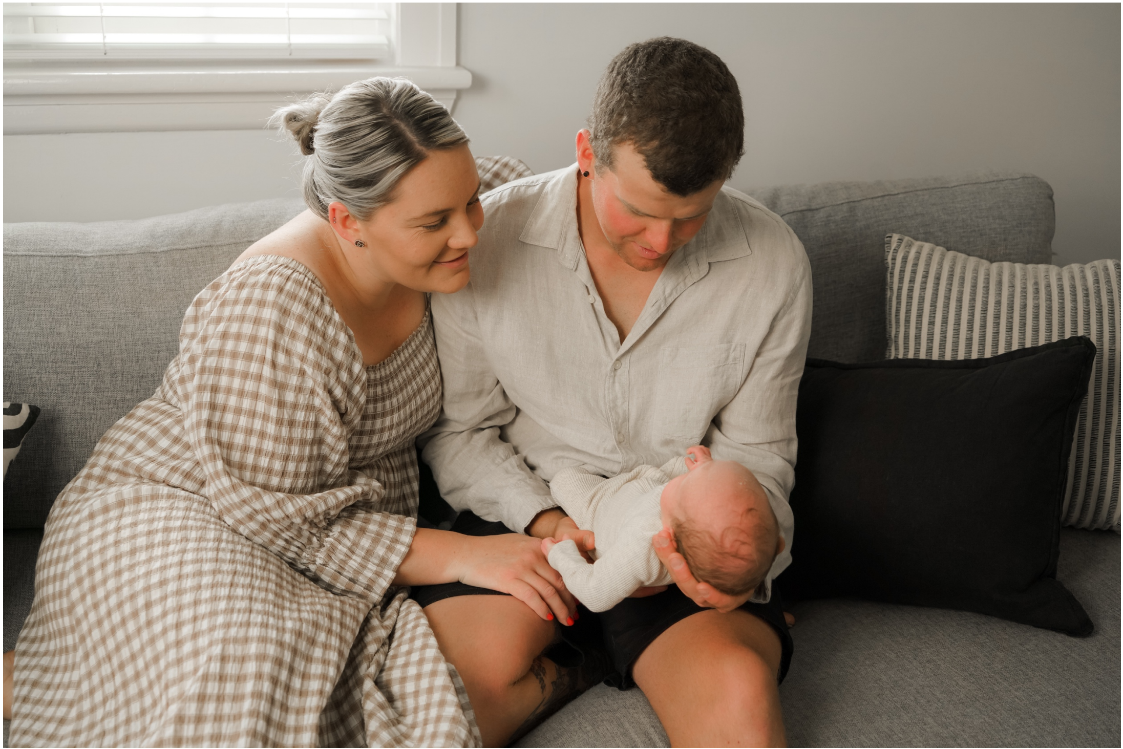
Creating memories that will last a lifetime