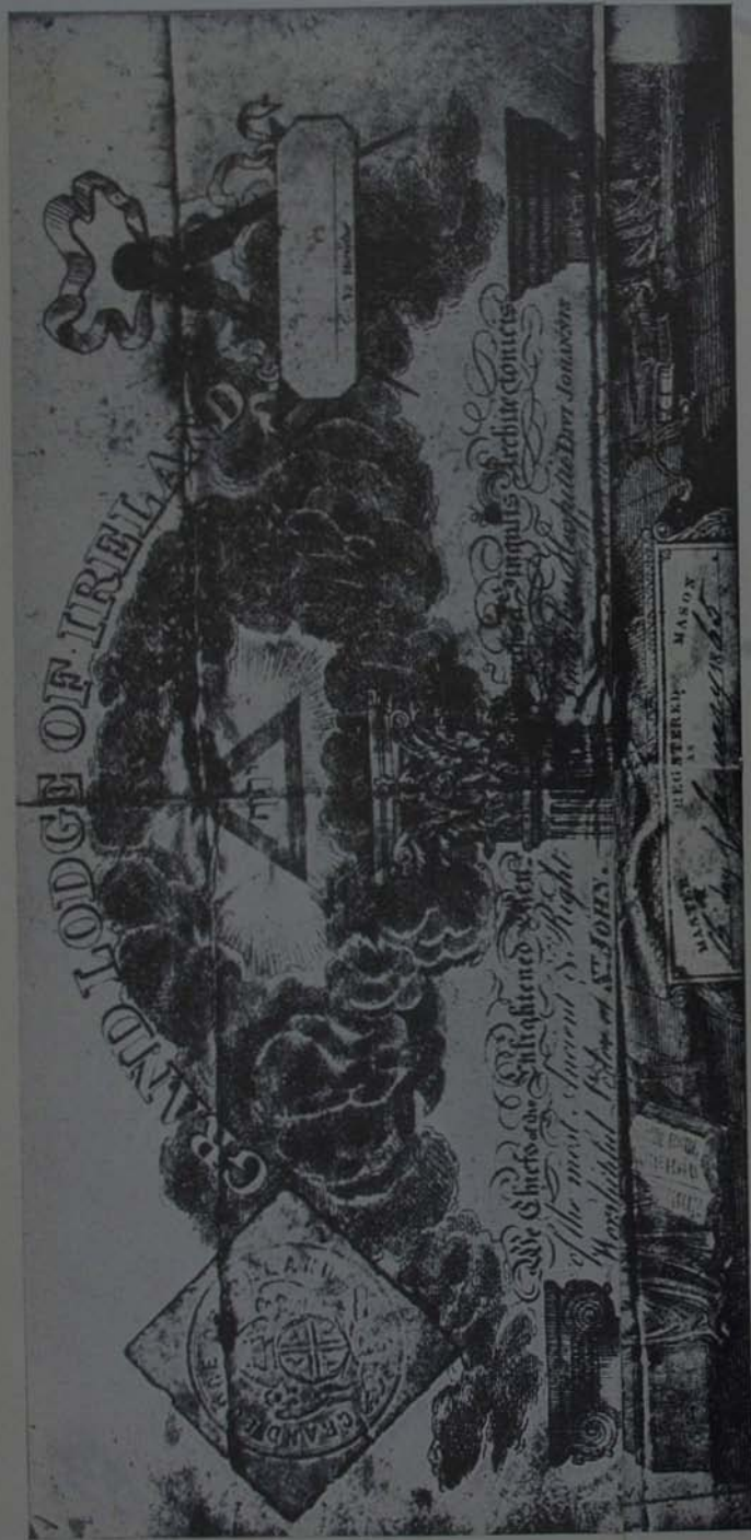
Master Mason's Certificate of the Grand Lodge of Ireland

(The name of the member, now deceased, has been for obvious reasons intentionally obliterated).