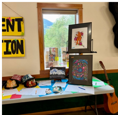
So many donations!