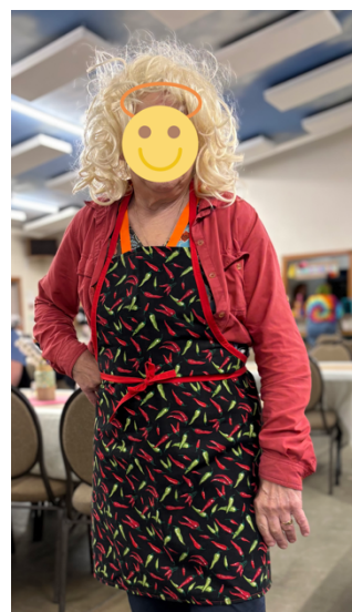
A glum lot? Nope!

Thank you Roundup committee! It was a stellar event and a good time had by all!