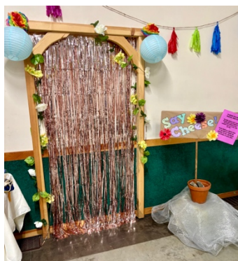
The "ham-it-up" booth