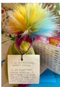
Everyone needs an emotional support chicken!