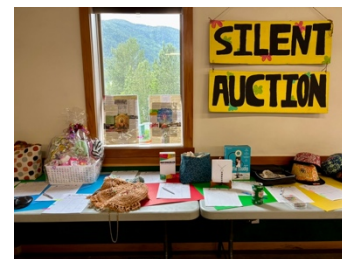
The sign says it all