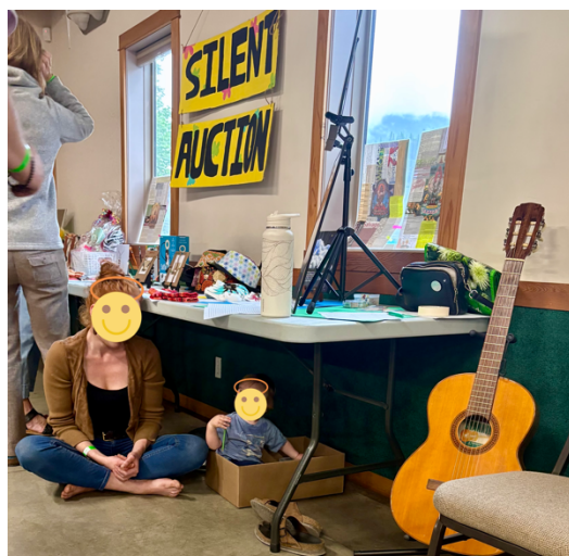
Mom and kid-friendly too!