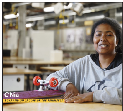
Whitaker Lab Summer Program https://vimeo.com/1011080413/47dc277271?share=copy