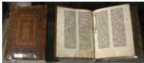
The Ransom Center's copy of the Gutenberg Bible