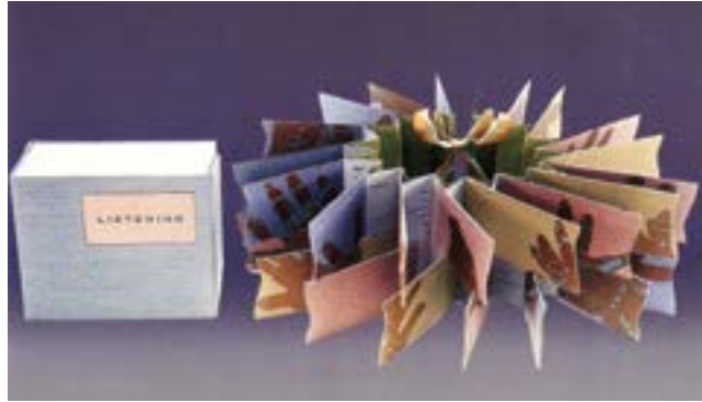
Juli Chen, Listening , 1992

dimensional potential of the book, in uniquely subtle and refined executions. One of her books was possible to wear like a crown. Chen's Flying Fish Press, begun in 1987, continues to publish editions of 25 to 100 copies of book projects that she produces at the highest level of craft in harmony with contemporary ideas. All are perfect combinations of design and skill. Chen works with both letterpress printmaking and cutting edge technical processes, inventing entirely new structures with each project, usually incorporating a box of some kind. Densely packed with imagery and illusive suggestions,