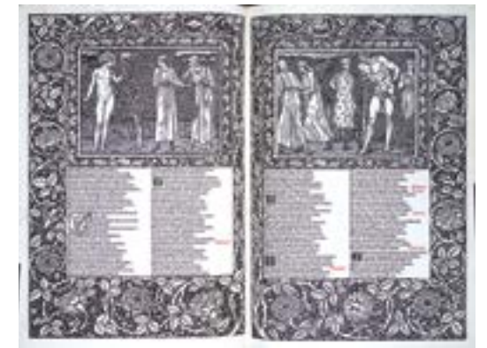
Kelmscott Press, The Works of Geoffrey Chaucer