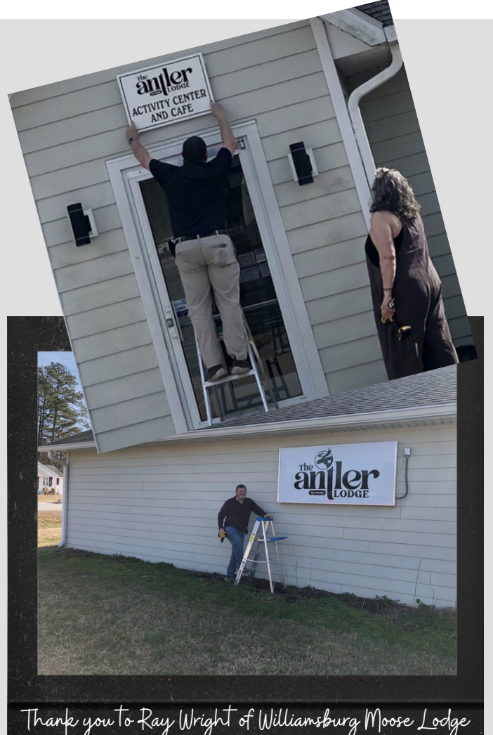
757 for the beautiful signs outside the pool house!!!