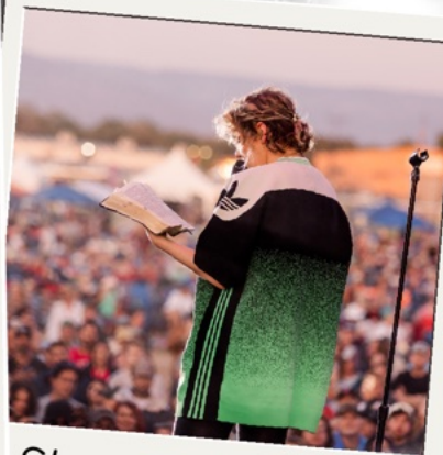
Sharing God's Word