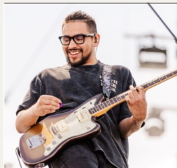
Strings & Heart