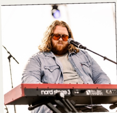
Cochren & Co