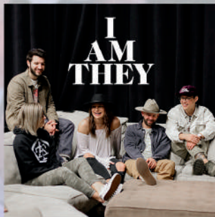
I AM THEY

For pop worship band I AM THEY, believing in God's faithfulness is an active exercise in trust. After years of member transition and internal uncertainty with how or even why to move forward, they are leaning on Hebrews 10:23 – "Let us hold unswervingly to the hope we profess, for He who is promised is faithful." The band poured the challenges of the past, hope for the future and a newfound joy for the present into their third album, Faithful God . More than a collection of new songs, "Faithful God" is a look back and a look forward, a declaration of promises kept and promises yet to come.