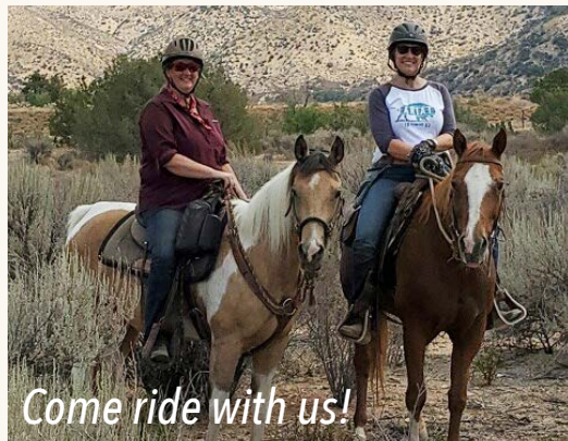
Come ride with us!