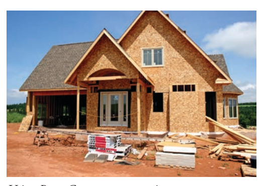
Using Bora-Care as your termite treatment can save up to a full day of cycle time.