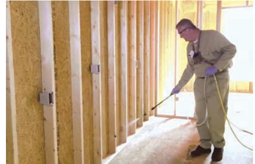
Bora-Care is applied to your homes by your pest company during the dried-in phase of construction.

Nisus now offers the Bora-Care 30-Year Limited Warranty to pest control companies who register treated homes and inspect them annually. This damage repair warranty, which is extended to the pest control companies, gives builders and homeowners peace of mind knowing their homes can be covered under the limited warranty for the length of a standard 30-year mortgage. A Bora-Care treatment can help protect a home from subterranean termites. A whole house treatment can also be done to help protect the structure from drywood and Formosan termites, which can enter homes through windows and attics.