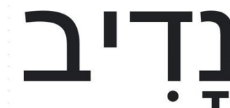
The Hebrew word for Generosity

Come dive deeper into this word from a Hebrew perspective. Isaiah 32:8 But generous people plan to do what is generous, and they stand firm in their generosity.