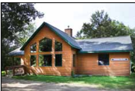
Peniston-Wilson Cottage Comfortable, modern five bedroom house with four baths, Wi-Fi, living room, gas fireplace and deck. Cap. 14 (5 queens, 4 singles)