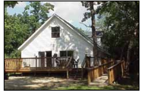
Hobley Cottage Comfortable, modern three bedroom house with three baths, Wi-Fi, living room, gas fireplace and deck. Cap. 9 (4 queens, 1 single)