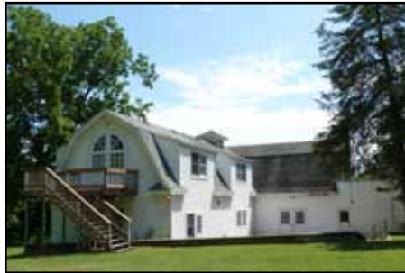
Bruce Kinney Lodge* Renovated Lawson era barn. Two suites, kitchen, dining and living room, wood burning fireplace. Four bedrooms, two and one half baths. Guests make beds on arrival. Cap. 18 (3 queens, 6 bunks)