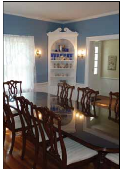
White House dining room