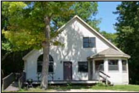
Borden Cottage Four bedrooms, three baths, Wi-Fi, living room, gas fireplace and large deck. Cap. 10 (2 queens, 2 singles, 2 bunks)

Most of our beautiful forest houses have large living rooms which make great gathering places. Houses are equipped with linens, cooking and dining equipment. Two night minimum stay required.