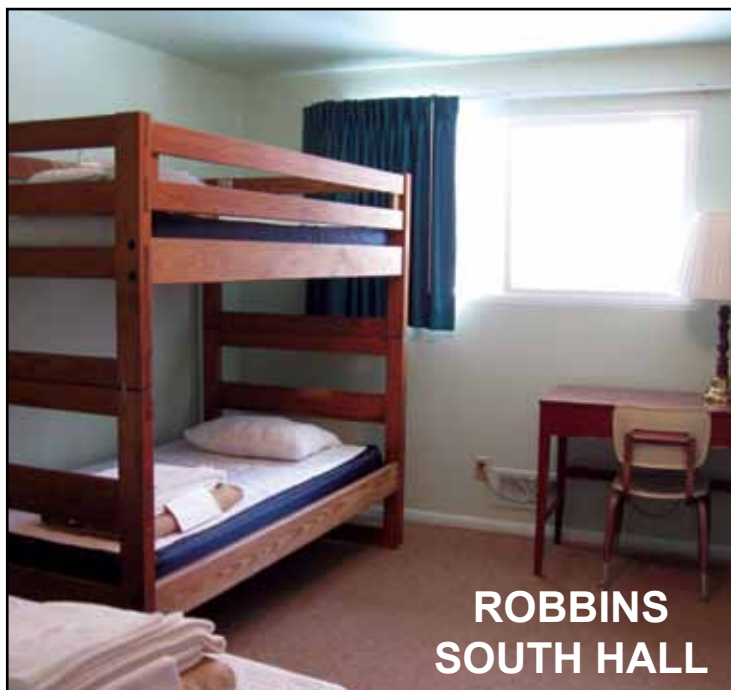
ROBBINS SOUTH HALL