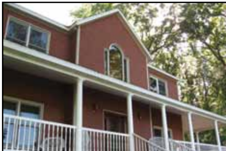
Kimsey-Edwards House Comfortable, six bedroom house with three and one half baths, living room, gas fireplace and deck. Cap. 14 (2 singles, 4 queens, 1 bunk, 1 trundle bed)