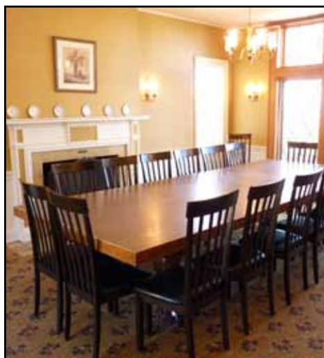
Christian Writing Center dining room

Charming two-story English-style stone house with four bedrooms, two and one-half baths and a sunken living room with Clavinova piano, gas fireplace and wonderful lake views. Cap. 12 (1 queen, 8 singles, 2 single sofa beds)