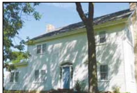
White House* Early American colonial house. Four bedrooms, three baths, wood burning fireplace and sun porch. Cap. 12 (1 queen, 8 singles, 1 daybed, 1 single hide-a-bed)