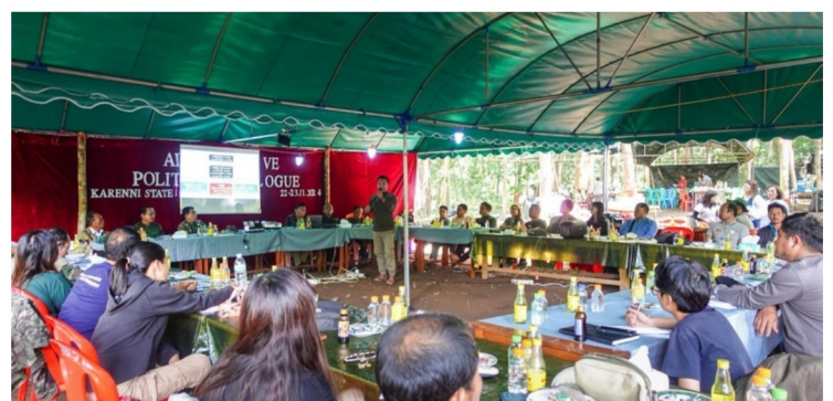
Figure 5 – 1st All inclusive Political Dialogue