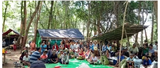
Figure 2 – Meeting with IDPs in the State

The IA was developed and enacted to adequately address Karenni State's critical needs such as Executive Power, Legislature and Judiciary as well as sectors on Education, Health, Humanitarian aid, Defense and Security and so on.