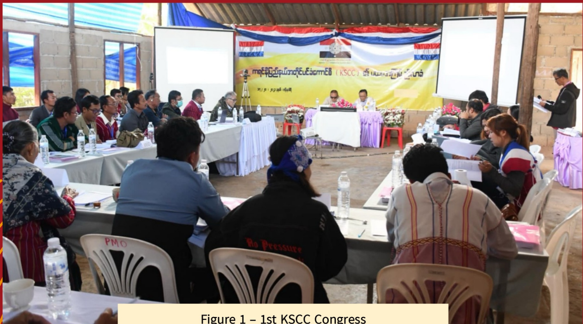
Figure 1 – 1st KSCC Congress

“This factsheet serves as the public presentation of a summary of activities of Karenni State Consultative Council (KSCC) since its establishment from 2021 to 2024. This outlines the background of the establishment of KSCC, its political activities and progress made during the four years together with a brief future plan.”