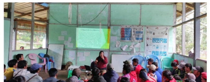
Figure 3 – Public Consultation

The adjustments were made to the IA to align with timely changes, and reapproved in October 2024.