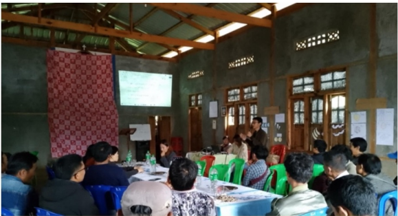
Figure 6 – Consultation on Health Policy

The Committee was formed on September 16, 2023, as per the Interim Arrangement and consists of 15 members. They are currently drafting the transitional constitution and aims to finalize the first draft in 2025.