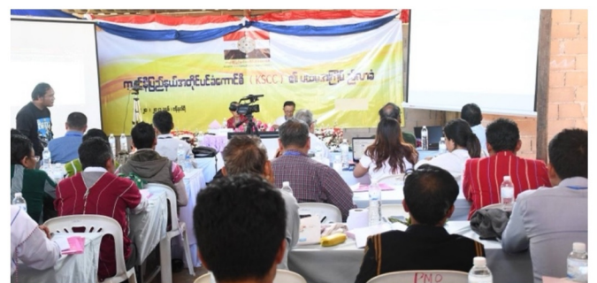
Figure 4 – 1st KSCC Assembly