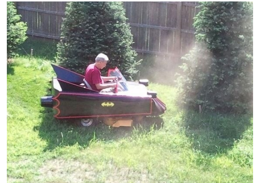
"how's life going?" me: