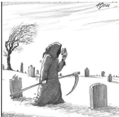
"Fine, I'll take the extended warranty on my vehicle, but let's close the deal in person."

Hi honey ... did you enjoy the Drag Strip ? What did they think about Your EV powered car ?