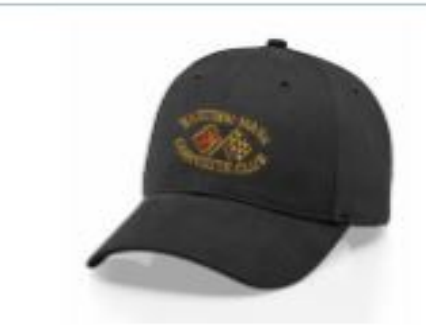
Richardson Black Cap