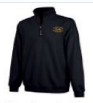
Charles River Crosswind Sweatshirt