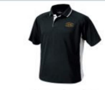
Charles River Polo