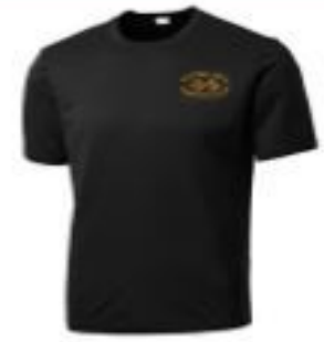
Sport-Tek Short Sleeve Dri Fit Tshirt