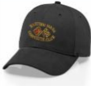
Richardson Black Cap