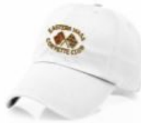
Richardson White Cap