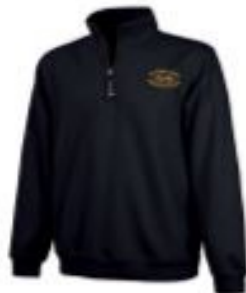
Charles River Crosswind Sweatshirt.