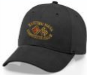
Richardson Black Cap