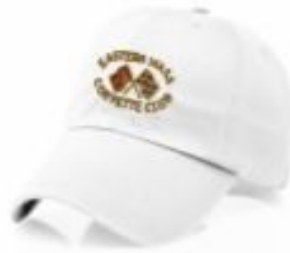
Richardson White Cap