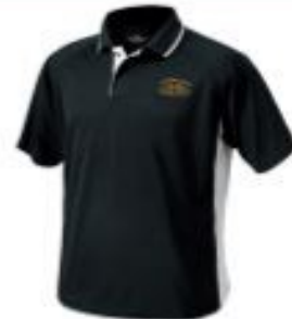
Charles River Polo