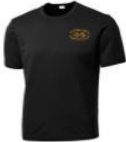
Sport-Tek Short Sleeve Dri Fit Tshirt