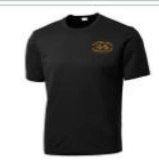
Sport-Tek Short Sleeve Dri Fit Tshirt