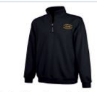
Charles River Crosswind Sweatshirt