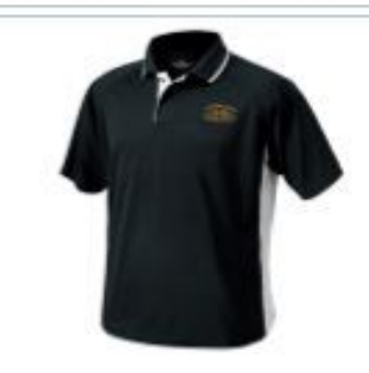
Charles River Polo