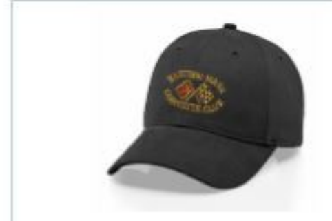
Richardson Black Cap