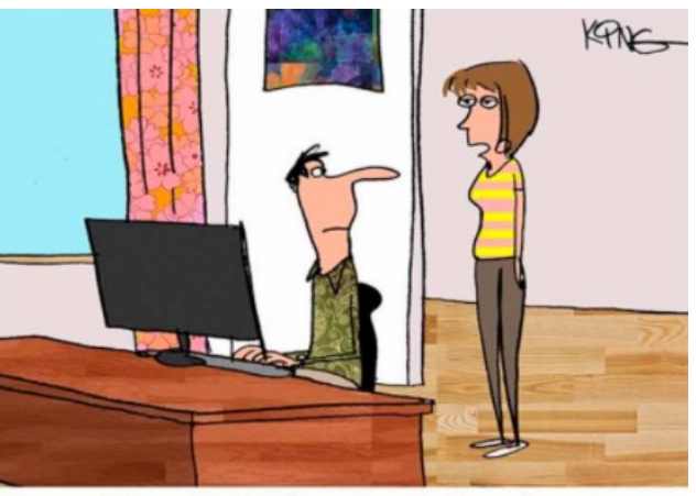
"Our neighbor is at the door. You only washed your Corvette 5 days this week, so he's concerned."