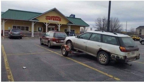
An Outback pulling an Outback, parked out back at an Outback