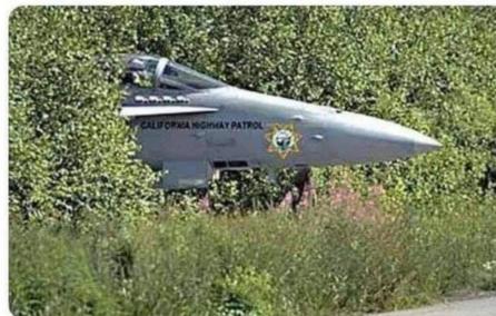
moments after you disregarded that "patrolled by aircraft" sign