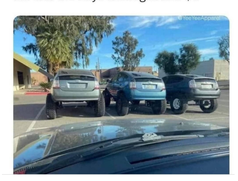
Me and the boys when gas hits $6

I got gas for $2.39 today. Unfortunately it was at Taco Bell.