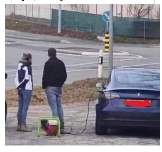
A gas powered generator for an electric car.

Usually I don't like camo wraps but this one is really well done