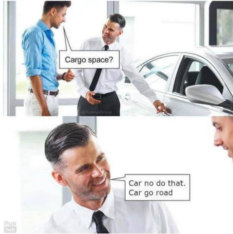
The New Smart Van