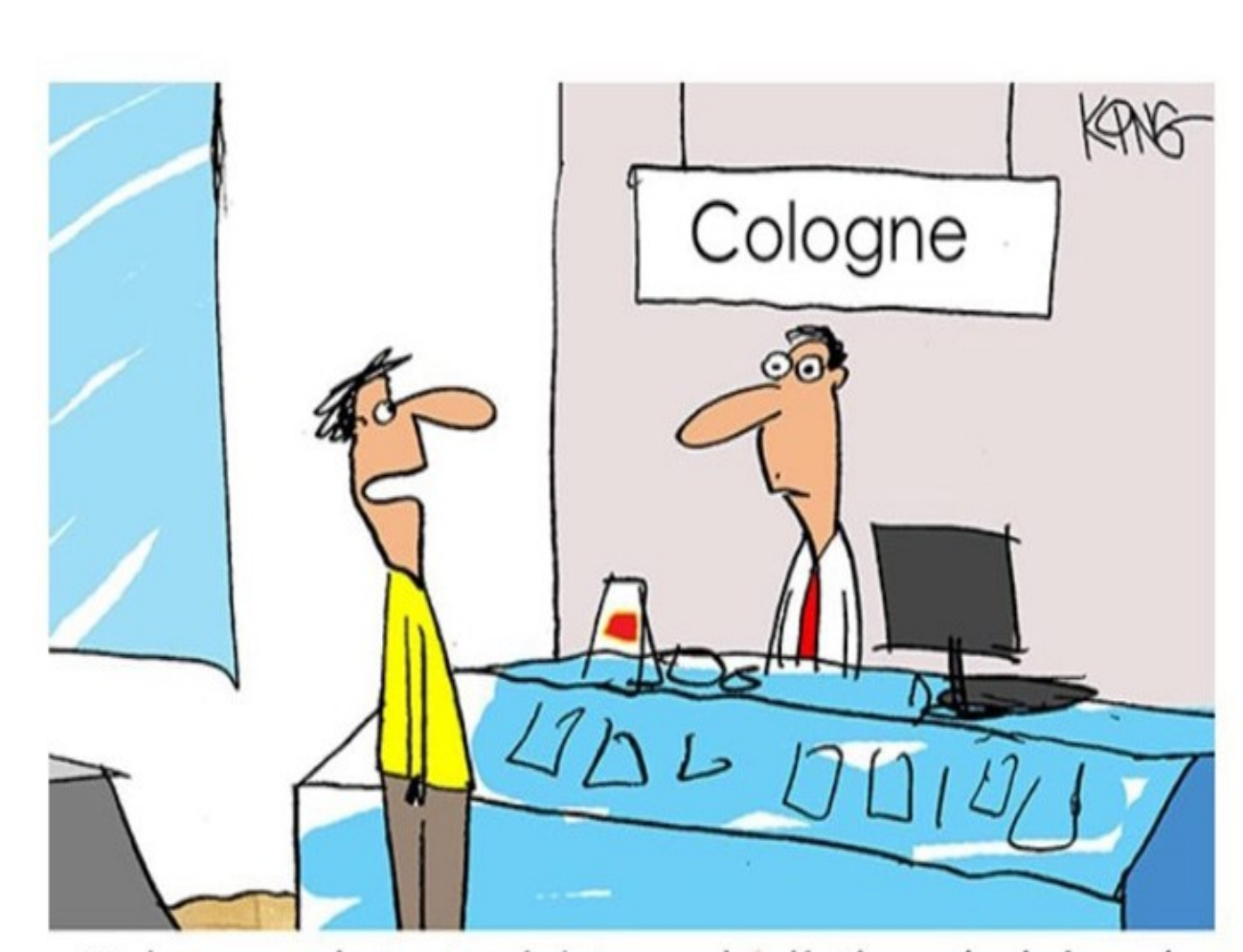
"I have a date tonight, and I lied and claimed I owned a Corvette. Do you have a cologne that smells like a Corvette?"