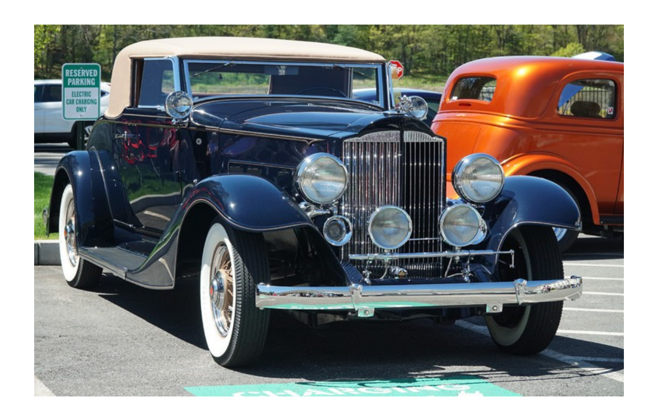
NOTE: The Packard is \underline{NOT} an electric car