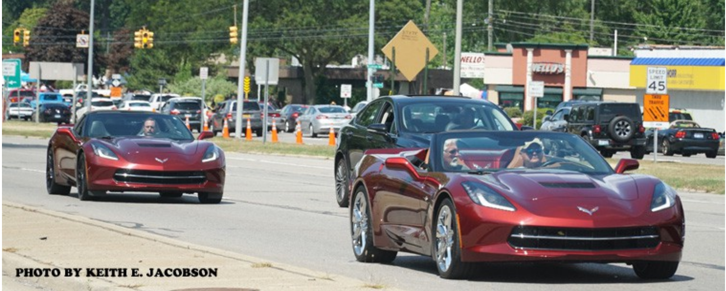
Corvette’s cruise down Woodward Avenue during the Woodward Dream Cruise 2019

GM is right to strive to offer us a sports car that has high aspirations yet is relatively affordable, modern, relevant, and still uniquely American. But does that mean “obliterating the tired old boomer-era sacred cows?” Was the Corvette “trapped by history” as MT opines, still cruising with muscle cars down Woodward Avenue? Perhaps. I guess time will tell.