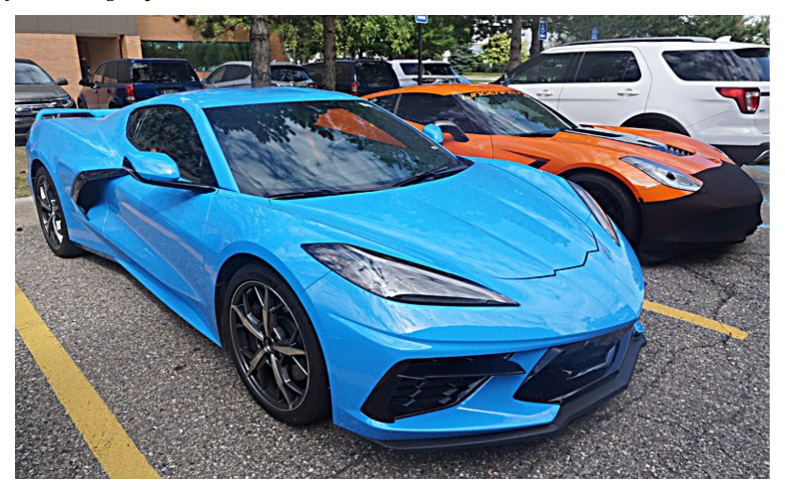
What you see is only a small part of GM's collection and there are so many amazing cars you pretty much go on sensory overload not knowing what to look at next.

Before entering the building we were surprised with a beautiful blue C8 parked out front just for our group.