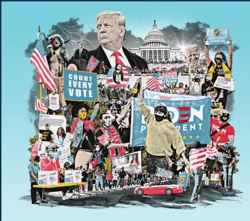
Cover of TIME Magazine | February 4, 2021