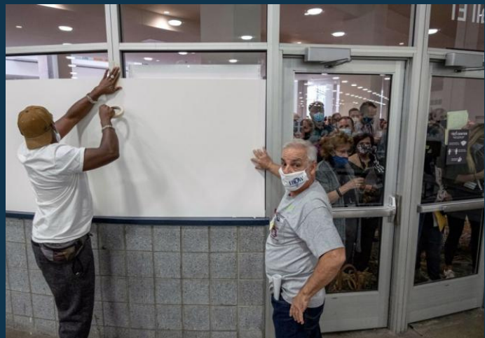
Poll workers block the public from viewing the ballot count. (Philadelphia, PA)

It's time for Americans to stop fighting each other and unify to push back against a tyrannical federal government. There is no longer a "lesser of two evils." There's just evil...God help us.