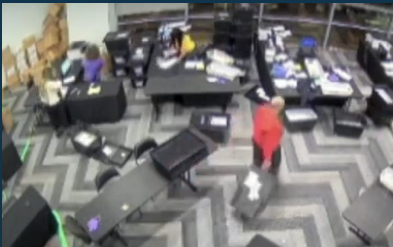
Containers of ballots produced after observers are sent home. (Fulton County, GA)

It is absolutely gut wrenching to watch frauds ruin our nation. But the shadow campaign was like a gift to naive Christians and conservatives who put their faith in one man, in the Republican Party and in our economy. Now is the time to do 2 Chronicles 7:14. God is extending undeserved mercy to a society that murders the unborn, practices paganism and idolatry, and indulges in sex and violence. America deserves death. Yet, He is granting an opportunity to repent and be restored. Our faith and hope should be in Jesus Christ alone.