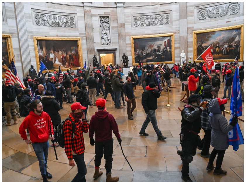
These Trump supporters are hardly insurrectionists. They likely followed agitators inside to look around. Anyone curious enough would have done the same thing.

This infiltration deceived even the most diehard Trump supporters. Some conservative commentators were so spooked they actually blamed supporters for defaming the right's peaceful movement. Leftist talking points dominated right-wing airways for days.