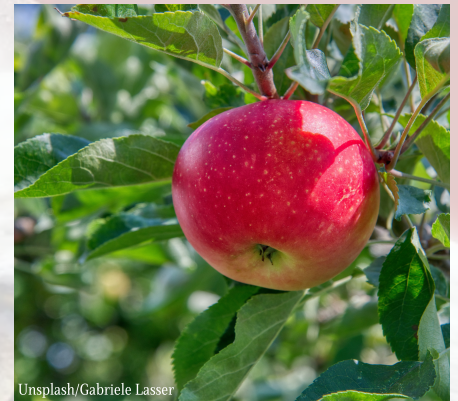
THE FRUIT OF SELF-CONTROL

Living with Contentment in a Culture of Excess