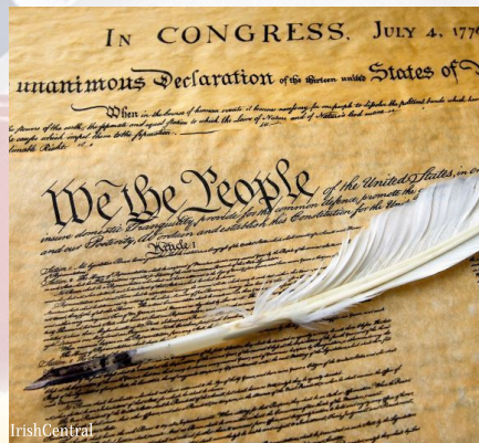
JULY 4, 1776: BEFORE THE FIREWORKS