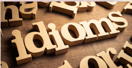
OUT OF THE FRYING PAN AND INTO THE FIRE

How to Sound Smart When Using Idioms and Clichés