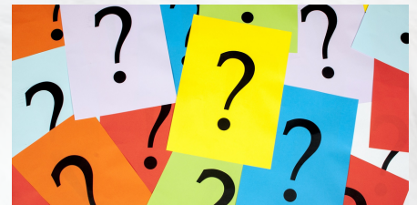
WHERE ARE THE ENTREPRENEURS?