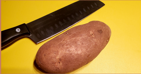
Choose a medium sized Russet potato

I am not a chef (or a photographer) but this gives you an idea of where to start. Try these before you make another drive-thru fry run!