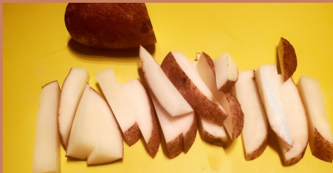
Cut potato in half, then cut one half into 1/4 inch to make fries