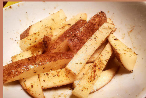
Add seasoning to coat each fry (be generous with non- salt seasonings)