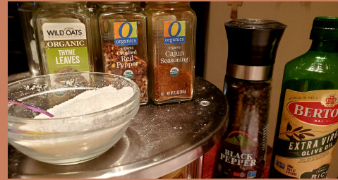
Use good spices and olive oil. (Onion/garlic powders not pictured, but highly recommended!)