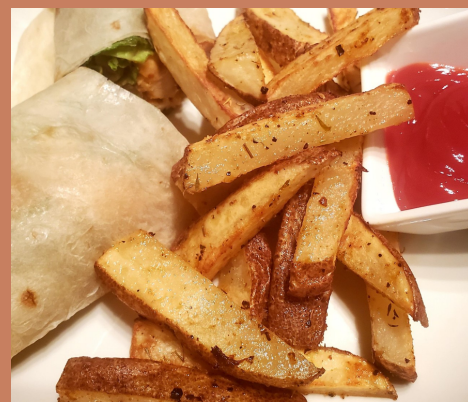
I had them with a homemade buffalo chicken wrap!