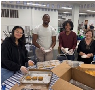
Preparations for Festival