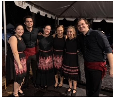
Our talented St. Theodore Dancers