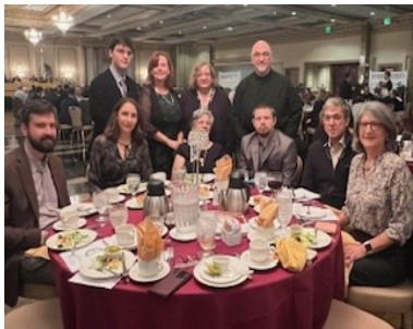
Metropolis Awards Banquet Nov 9th