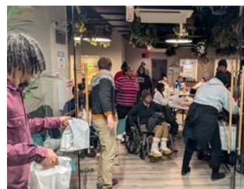
Feeding the Homeless & Hungry