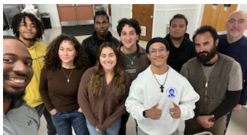
Recent Bible Study Photo