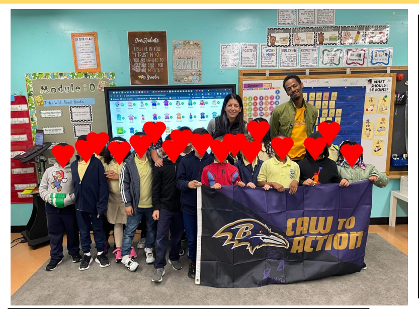
YAL AND GOYA GATHERINGS AND LUNCHEON—MARCH 12, 2023