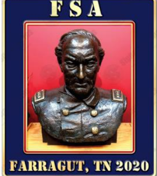
This is only available if you come to Farragut, TN 7-110CT2020. Hope to See You Then!

handsome Farragut Homecoming pin with the bust of the Old Man from the Farragut Folklife Museum on it.