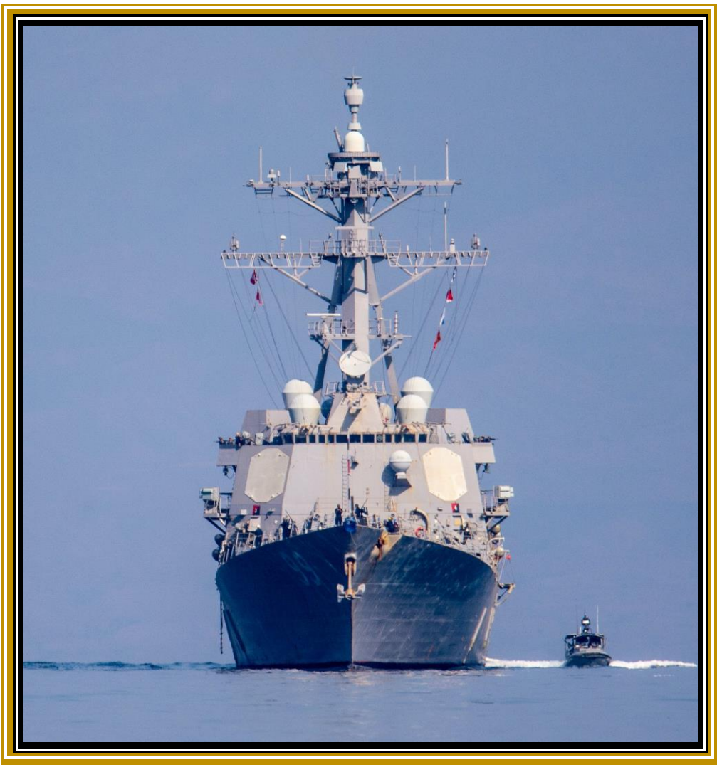
Coastal Riverine Squadron (CRS) 1 provides Anti-Terrorism Force Protection (ATFP) for USS Farragut (DDG-99) in the Gulf of Tadjoura, 1NOV2019