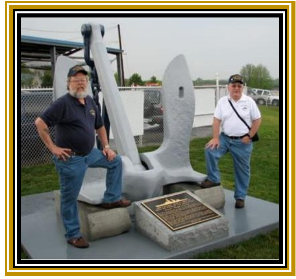
Latest FB Post of Anchor Dedication at Farragut High School in 2014 See these two and the Anchor in October!