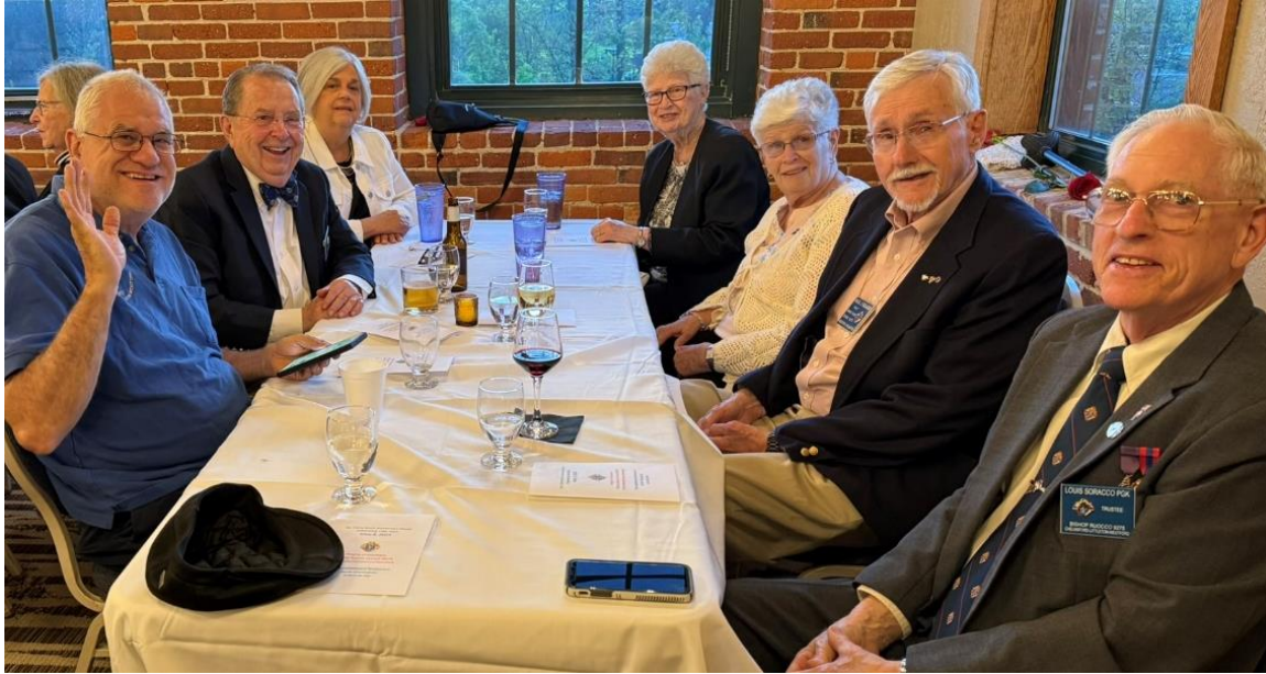
Knights and wives ready for next presentation at 39 th anniversary dinner

Dinner held at the Establishment restaurant in North Chelmsford.