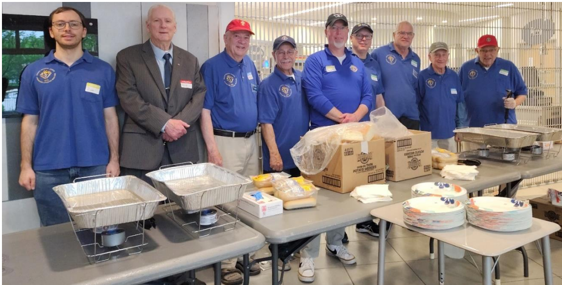
Brother Knights at the Special Needs Prom at Tewksbury