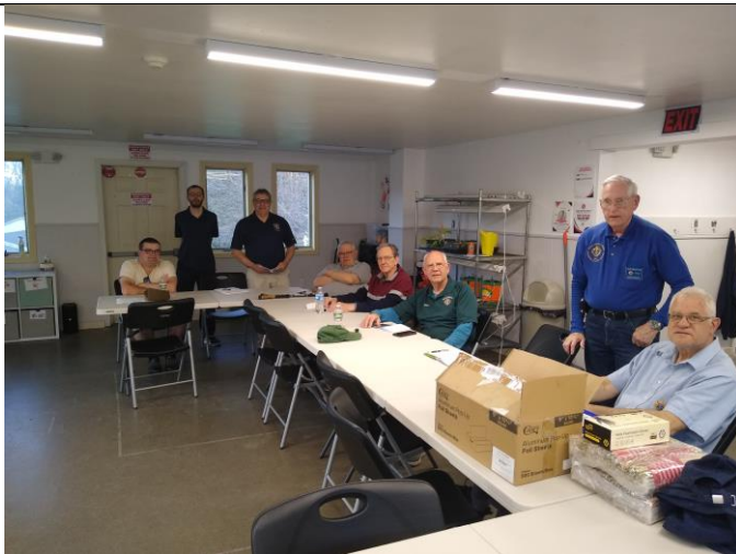
Twelve knights engaged in vigorous discussion at the second COR meeting. April 29. → Next COR meeting is Tuesday, June 4.