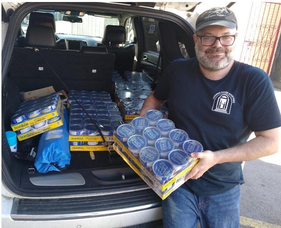
Recent delivery of 1,000 cans of tuna to Lazarus House

Bishop Ruocco council of Knights of Columbus has supported Lazarus House with time, money, food, and prayers in the battle with all these issues. The photo shows the donation and delivery of a recent purchase of 1,000 cans of name-brand tuna fish for the Lazarus House food pantry.