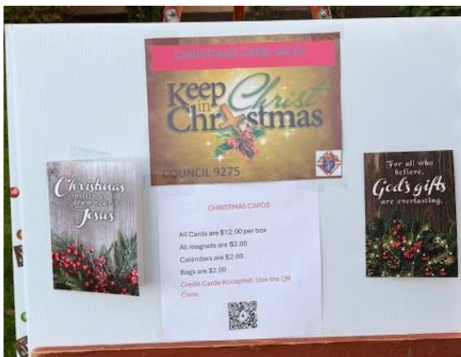
Keep Christ in Christmas cards were for sale after Masses in November.