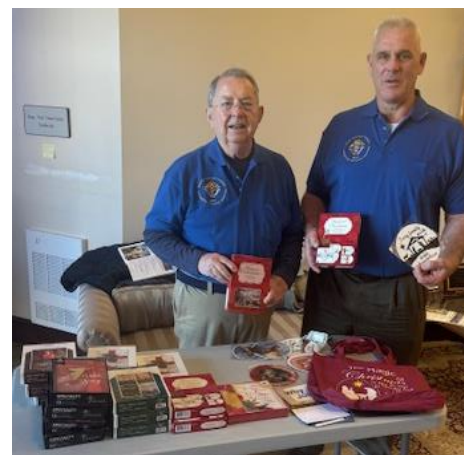
Brother knights man the Keep Christ in Christmas display.