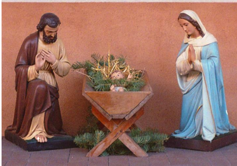
The new life given to us in the baby Jesus

The Yukon River drives an immense volume of water through vast spaces, pushing fallen trees, sand, and dirt, carving new channels in its bed. It has the power to sustain massive amounts of fish and wildlife. The power to change the lives of all who live on or near it. Then it freezes in the winter. Water becomes ice thick enough for trucks to drive on. Each year the river manifests the power of nature to change water into ice and ice back into water. Humans have no control over it.