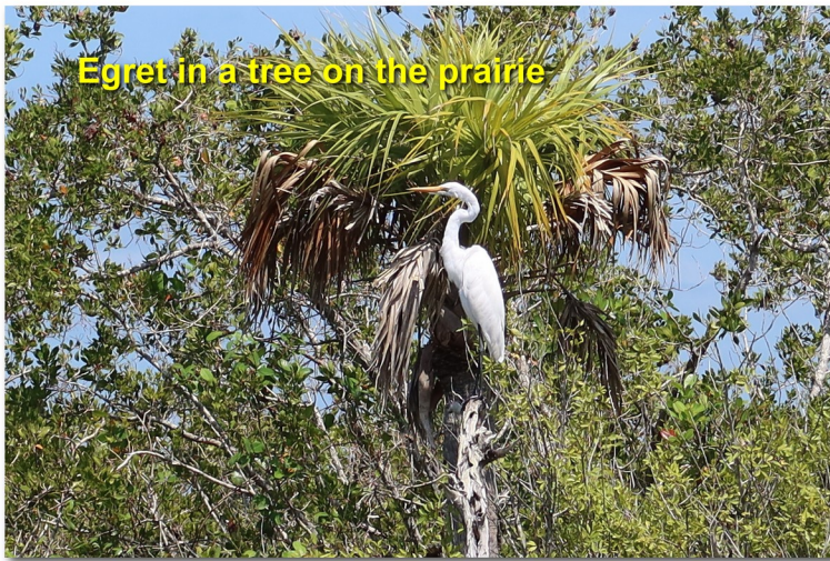
Egret in a tree on the prairie