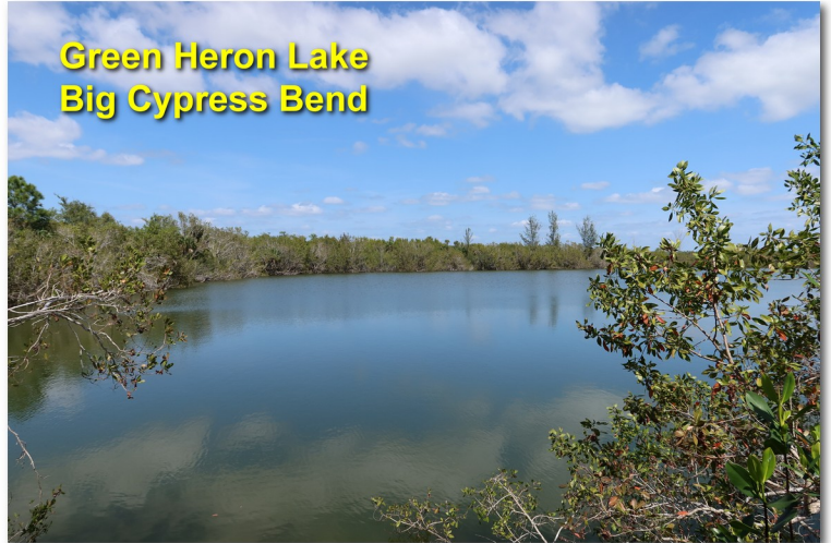
Green Heron Lake Big Cypress Bend

Old Boardwalk – To Be Repaired. Closed. New Boardwalk and Trail – Already Opened. New Boardwalk, Canopy Walk, and Trail – To Be built.