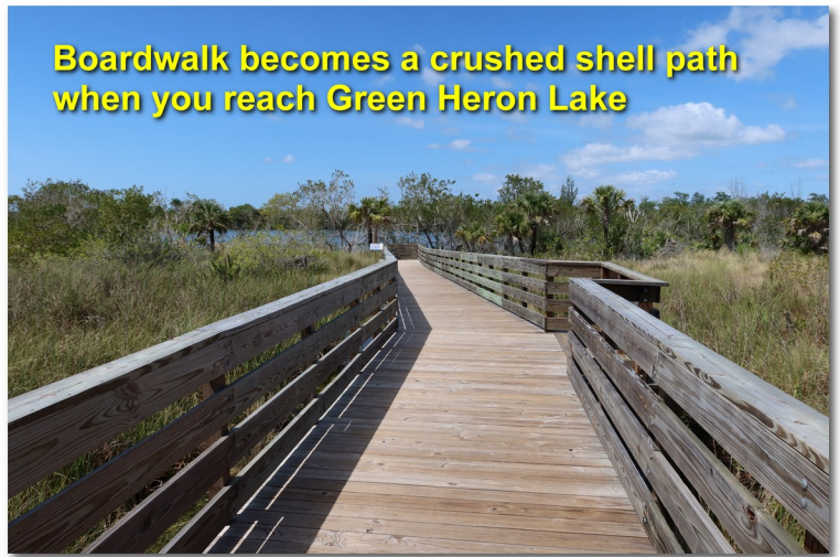
Boardwalk becomes a crushed shell path when you reach Green Heron Lake