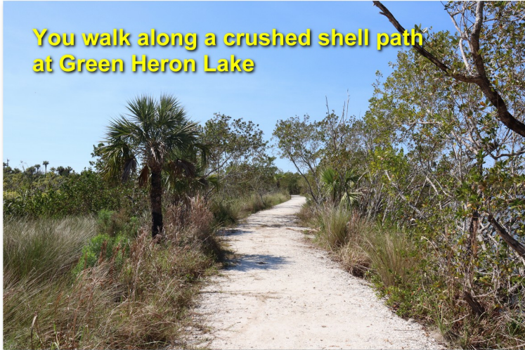
You walk along a crushed shell path at Green Heron Lake