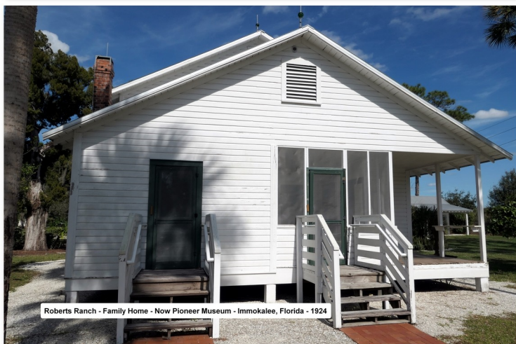
Roberts Ranch - Family Home - Now Pioneer Museum - Immokalee, Florida - 1924