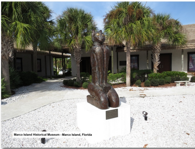
Marco Island Historical Museum - Marco Island, Florida