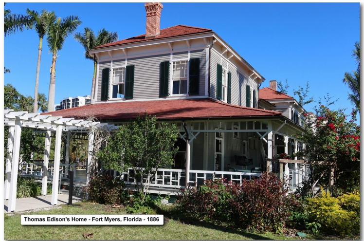
Thomas Edison's Home - Fort Myers, Florida - 1886