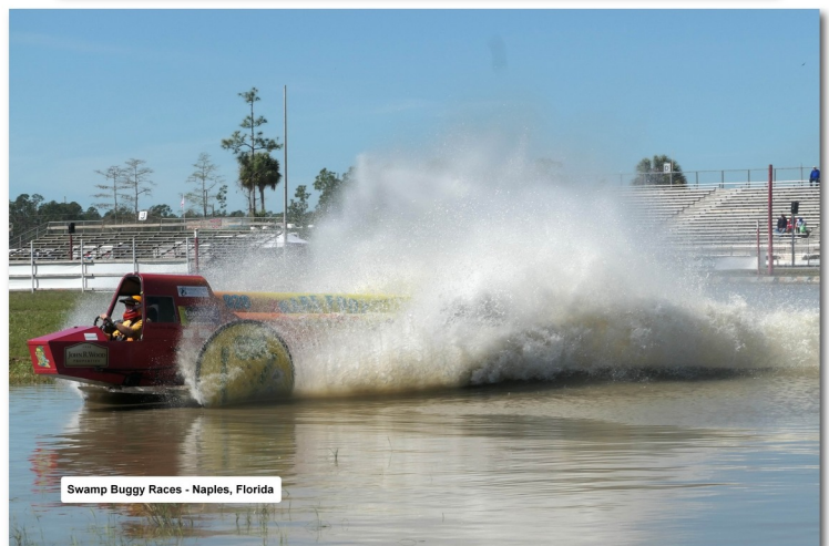
Swamp Buggy Races - Naples, Florida