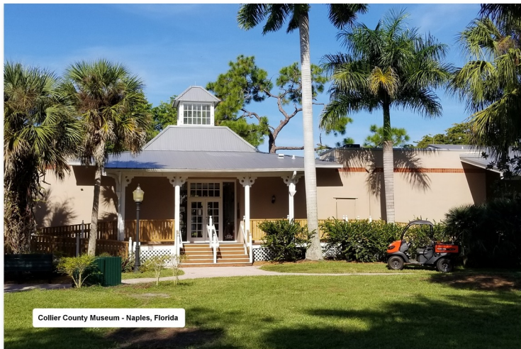
Collier County Museum - Naples, Florida