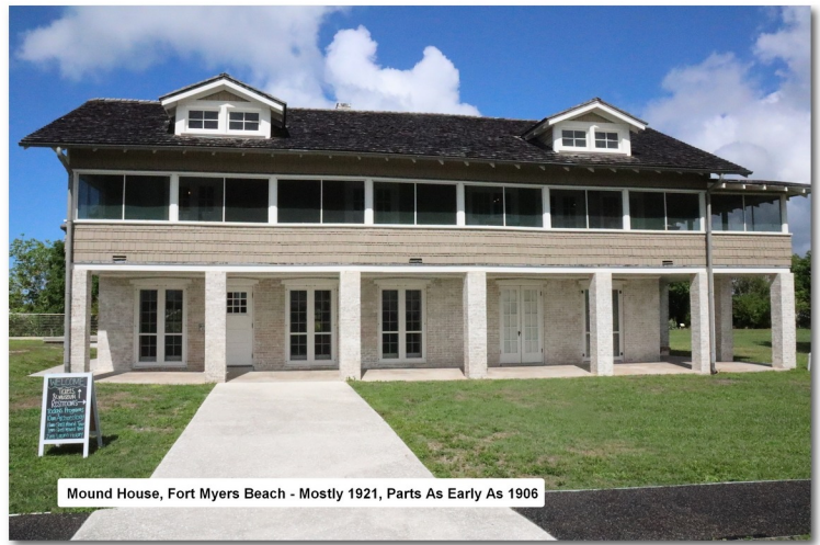
Mound House, Fort Myers Beach - Mostly 1921, Parts As Early As 1906