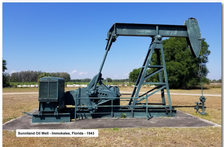
Sunniland Oil Well - Immokalee, Florida - 1943