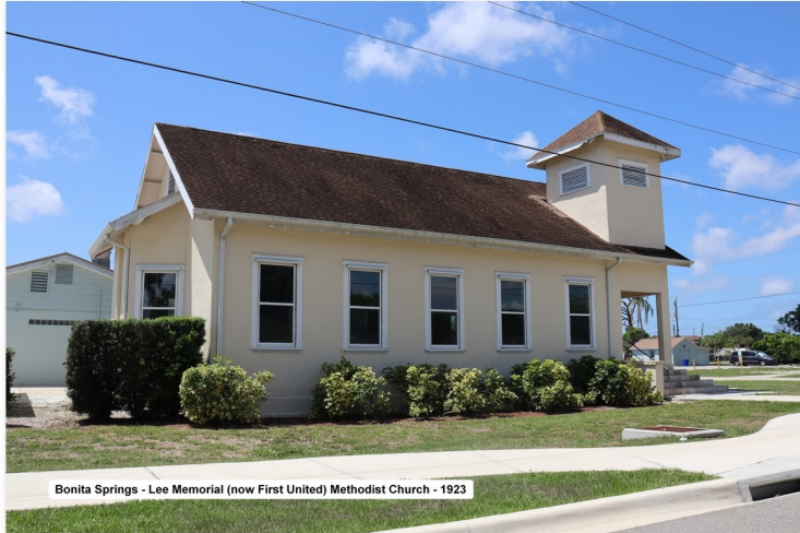
Bonita Springs - Lee Memorial (now First United) Methodist Church - 1923