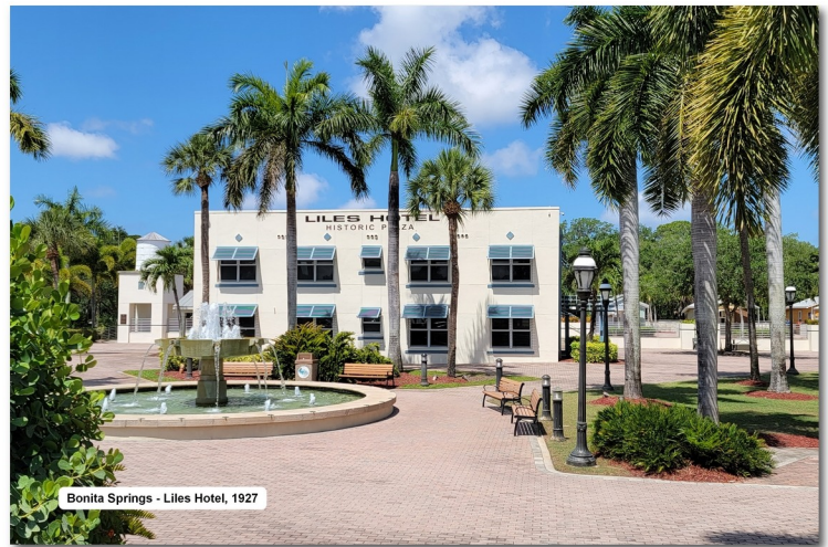
Bonita Springs - Liles Hotel, 1927