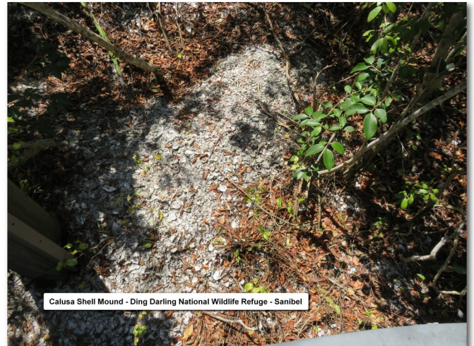
Calusa Shell Mound - Ding Darling National Wildlife Refuge - Sanibel