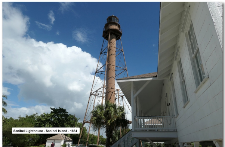
Sanibel Lighthouse - Sanibel Island - 1884