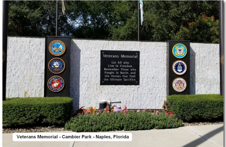
Veterans Memorial - Cambier Park - Naples, Florida