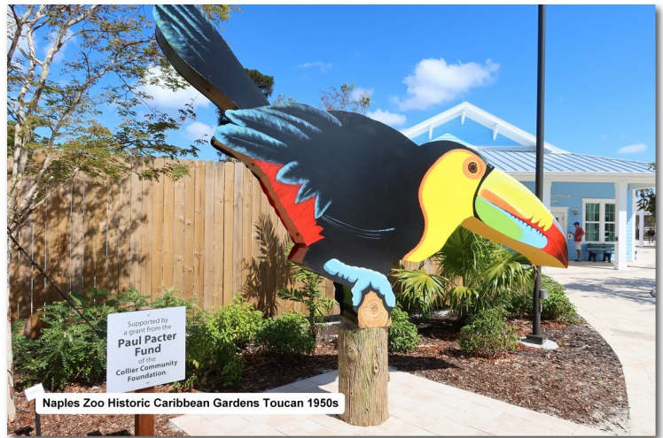
Naples Zoo Historic Caribbean Gardens Toucan 1950s