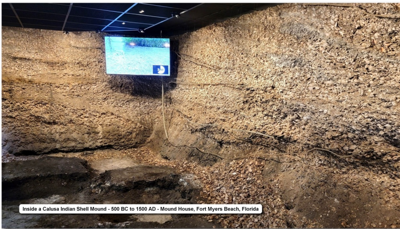
Inside a Calusa Indian Shell Mound - 500 BC to 1500 AD - Mound House, Fort Myers Beach, Florida