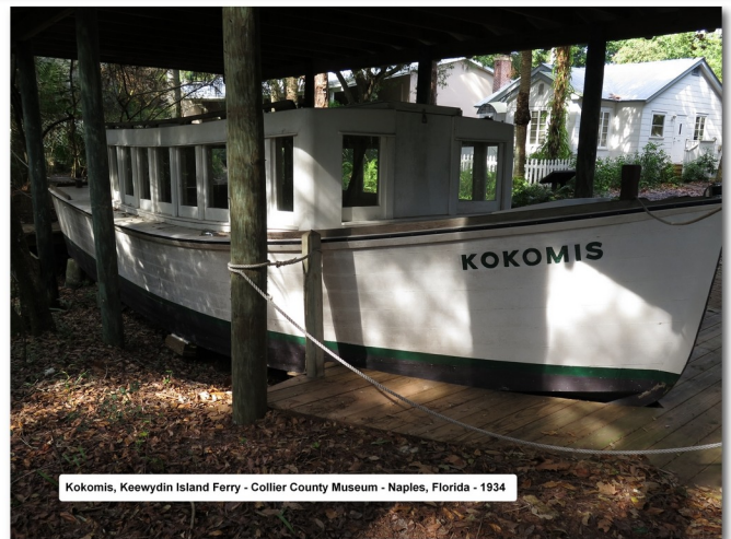
Kokomis, Keewadin Island Ferry - Collier County Museum - Naples, Florida - 1934