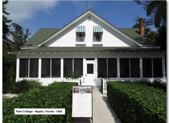
Palm Cottage - Naples, Florida - 1895