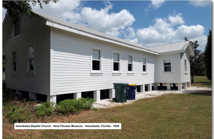
Immokalee Baptist Church - Now Pioneer Museum - Immokalee, Florida - 1928