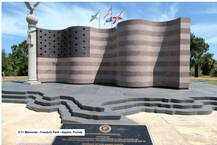
9-11 Memorial - Freedom Park - Naples, Florida