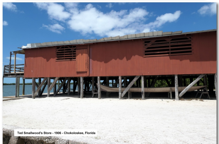
Ted Smallwood's Store - 1906 - Chokoloskee, Florida