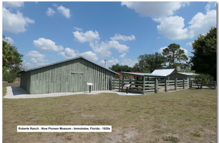
Roberts Ranch - Now Pioneer Museum - Immokalee, Florida - 1920s