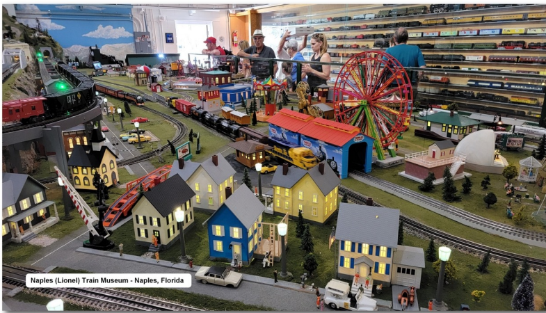
Naples (Lionel) Train Museum - Naples, Florida