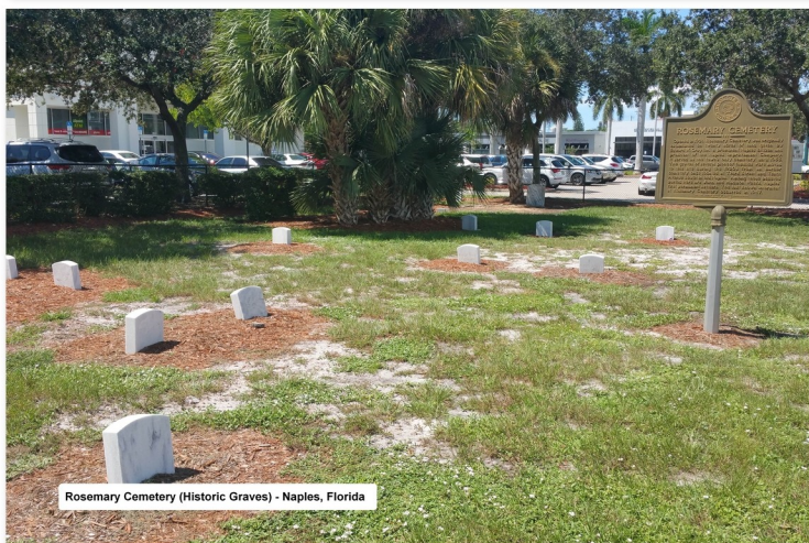
Rosemary Cemetery (Historic Graves) - Naples, Florida