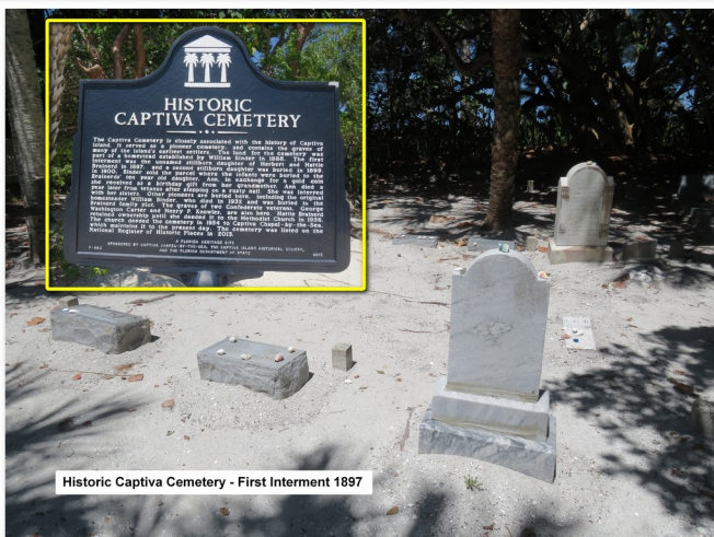
Historic Captiva Cemetery - First Interment 1897