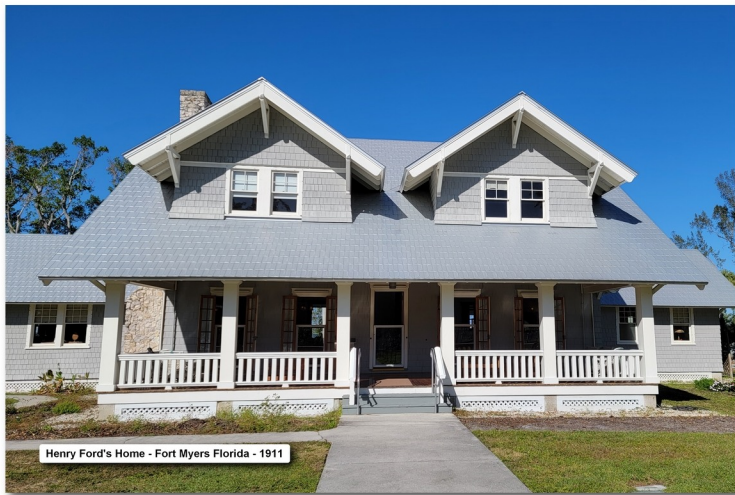
Henry Ford's Home - Fort Myers Florida - 1911