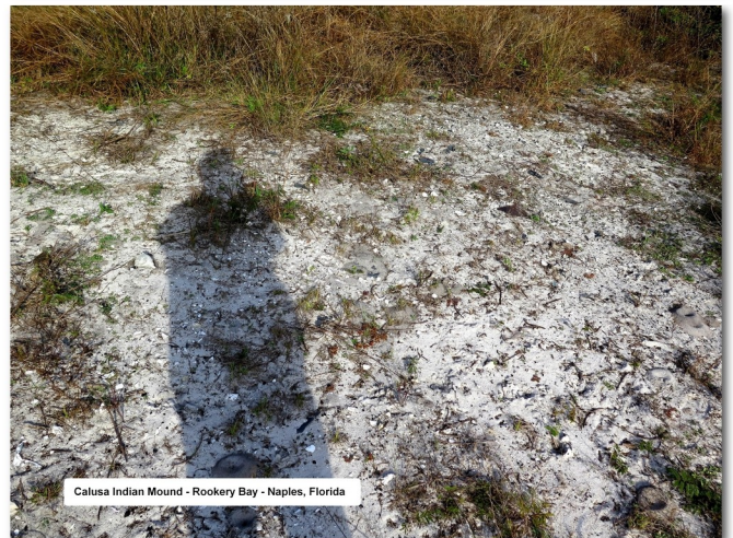
Calusa Indian Mound - Rookery Bay - Naples, Florida