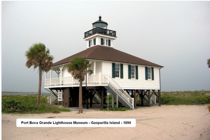
Port Boca Grande Lighthouse Museum - Gasparilla Island - 1890