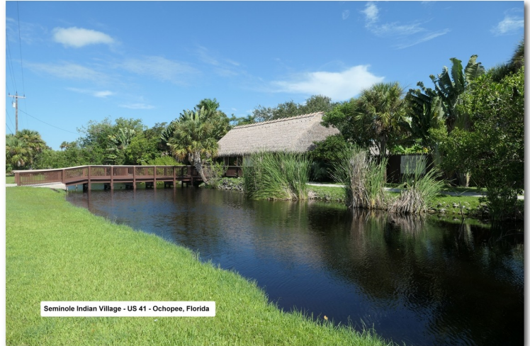
Seminole Indian Village - US 41 - Ochopee, Florida