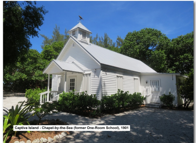
Captiva Island - Chapel-by-the-Sea (former One-Room School), 1901