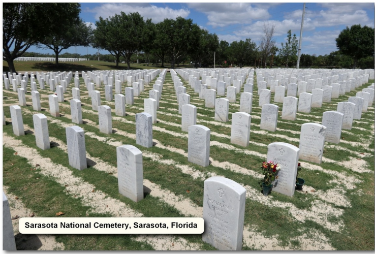
Sarasota National Cemetery, Sarasota, Florida