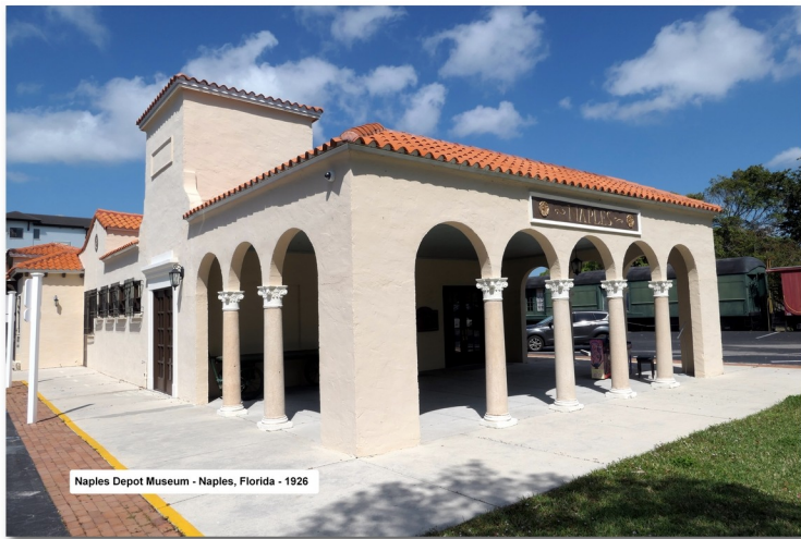
Naples Depot Museum - Naples, Florida - 1926