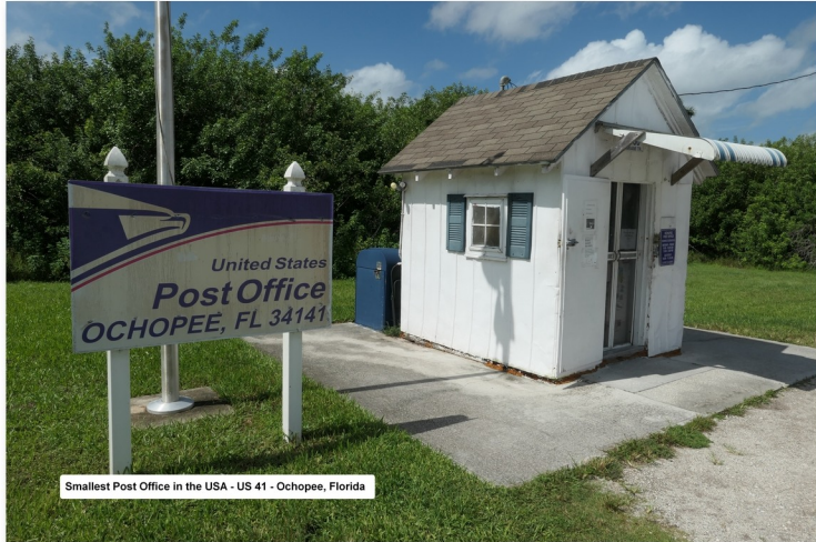
Smallest Post Office in the USA - US 41 - Ochopee, Florida