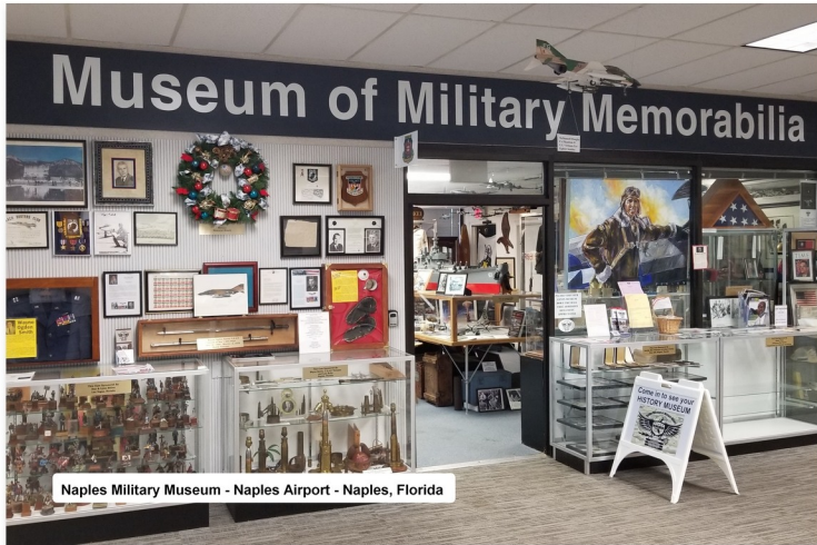
Naples Military Museum - Naples Airport - Naples, Florida