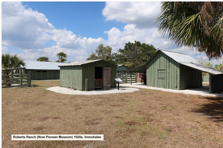
Roberts Ranch (Now Pioneer Museum) 1920s, Immokalee