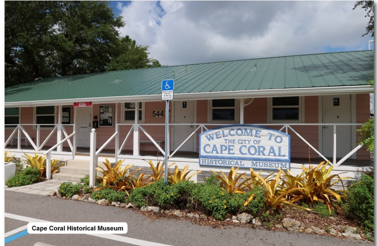
Cape Coral Historical Museum