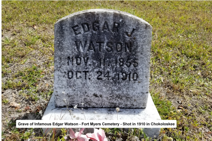
Grave of Infamous Edgar Watson - Fort Myers Cemetery - Shot in 1910 in Chokoloskee