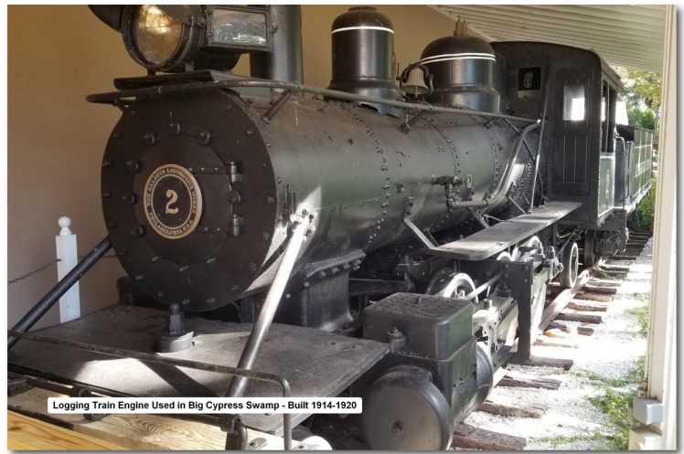
Logging Train Engine Used in Big Cypress Swamp - Built 1914-1920