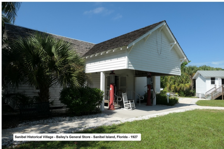
Sanibel Historical Village - Bailey's General Store - Sanibel Island, Florida - 1927