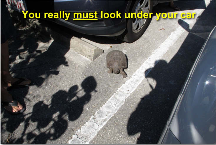
You really must look under your car