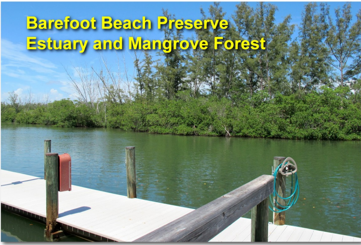
Barefoot Beach Preserve Estuary and Mangrove Forest