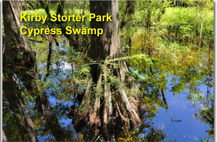
Kirby Storter Park Cypress Swamp