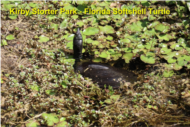
Kirby Storter Park - Florida Softshell Turtle