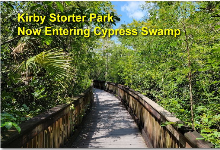
Kirby Storter Park Now Entering Cypress Swamp