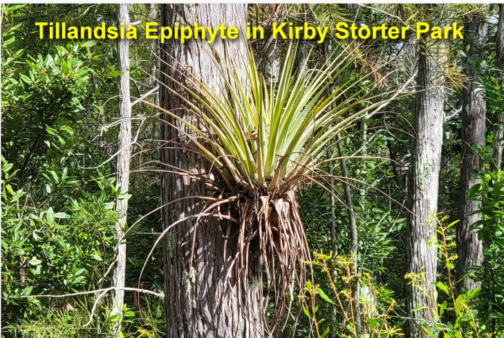
Tillandsia Epiphyte in Kirby Storter Park