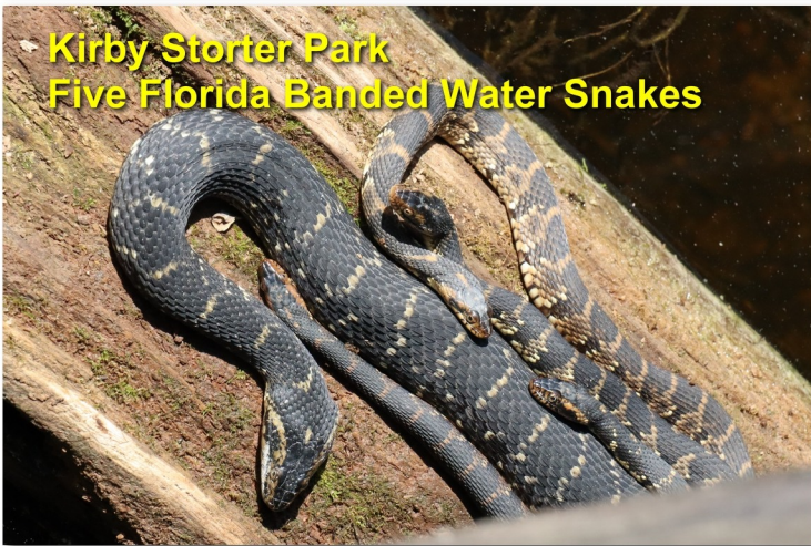
Kirby Storter Park Five Florida Banded Water Snakes