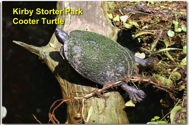
Kirby Storter Park Cooter Turtle