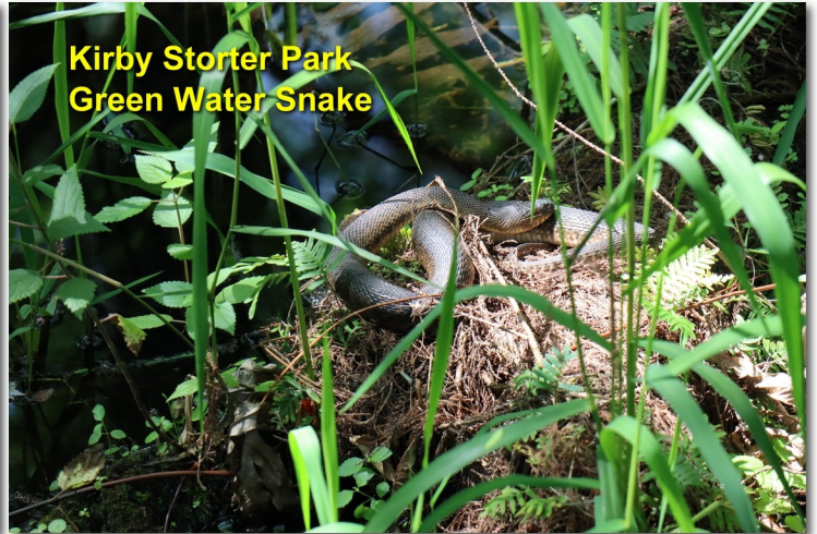
Kirby Storter Park Green Water Snake