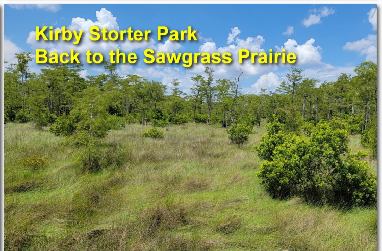
Kirby Storter Park Back to the Sawgrass Prairie