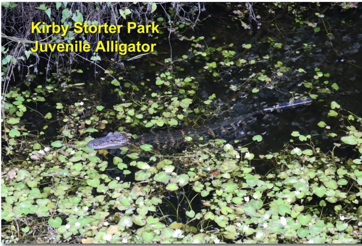
Kirby Storter Park Juvenile Alligator