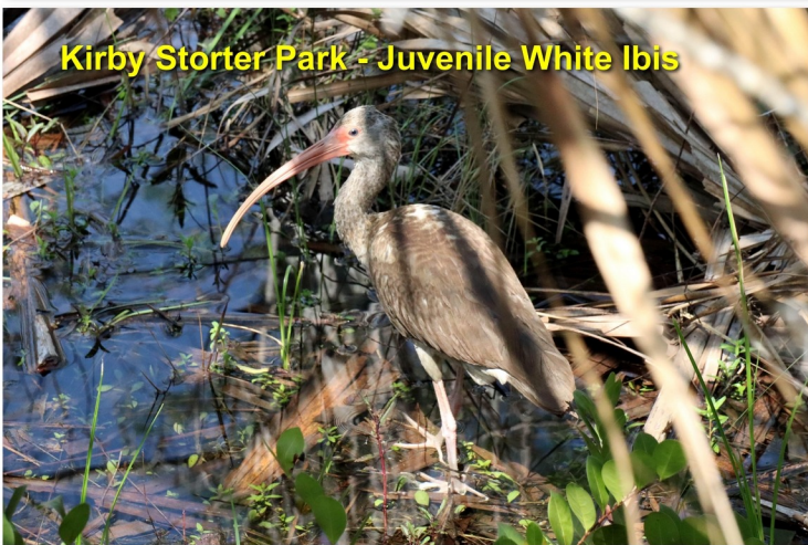
Kirby Storter Park - Juvenile White Ibis