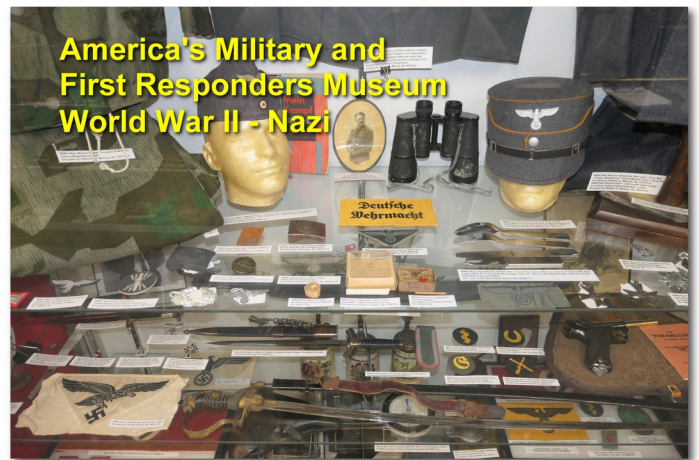
America's Military and First Responders Museum World War II - Nazi