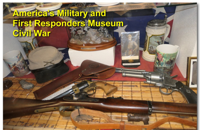
America's Military and First Responders Museum Civil War