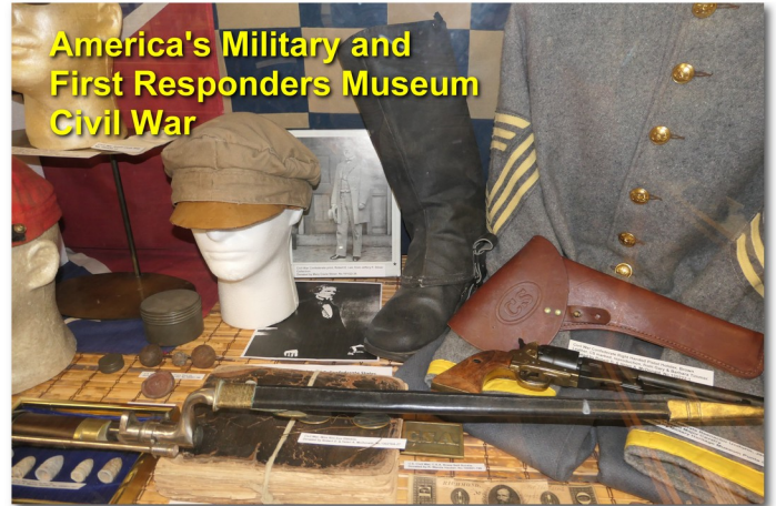
America's Military and First Responders Museum Civil War