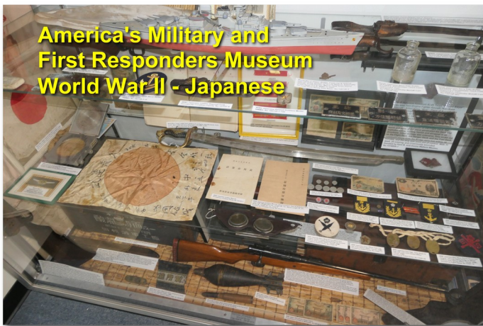
America's Military and First Responders Museum World War II - Japanese