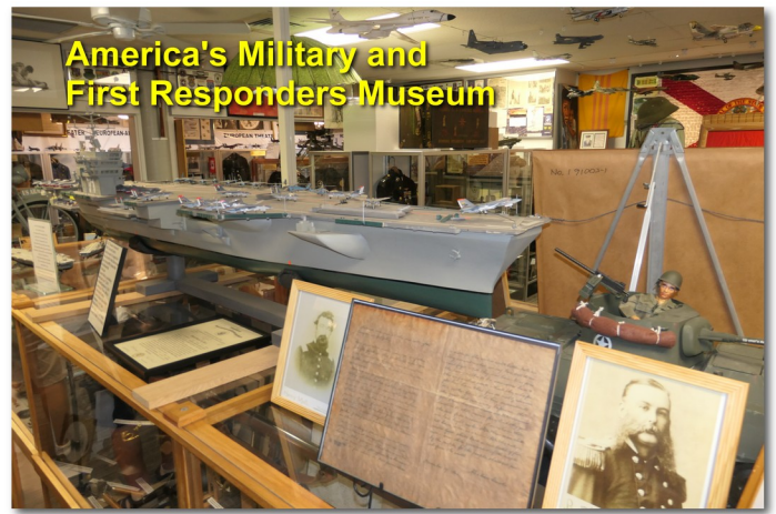
America's Military and First Responders Museum