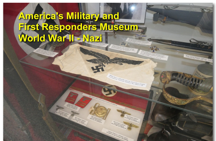
America's Military and First Responders Museum World War II - Nazi

WWII Nazi Utensils Kit Dated 1941, Steel Stip Case with Can opener Frame with Nazi Eagle GAG 41, Fork with Nazi Eagle GAG 41, Spoon with Nazi Eagle GAG 42, Knife with Nazi Eagle Rosette, On Loan Carl Benedetty Barry, No.190227-1