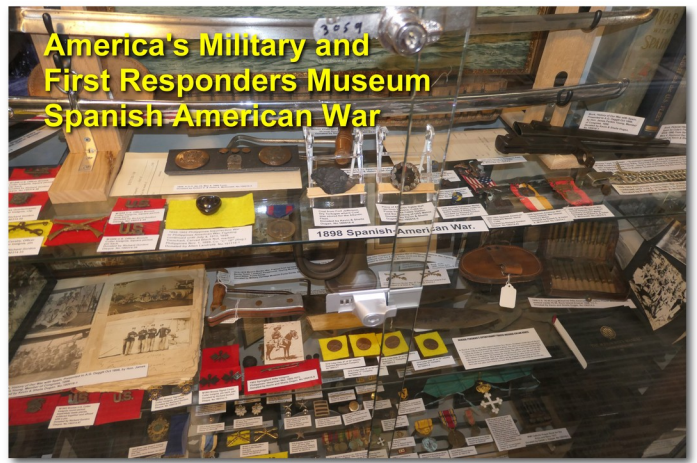
America's Military and First Responders Museum Spanish American War