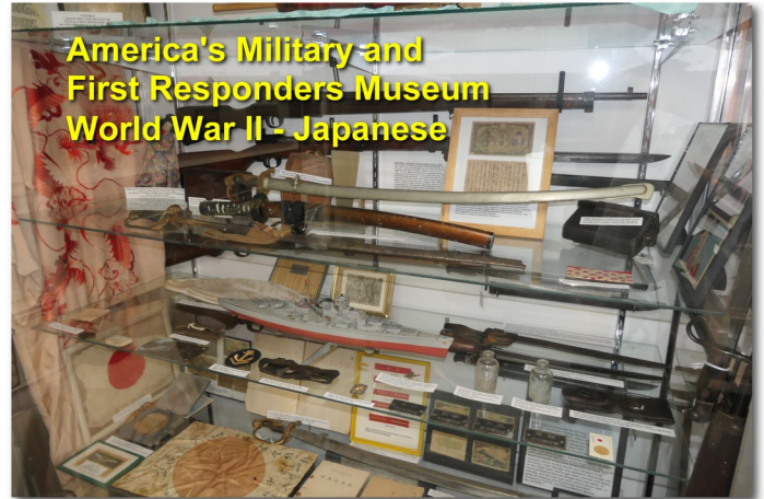
America's Military and First Responders Museum World War II - Japanese