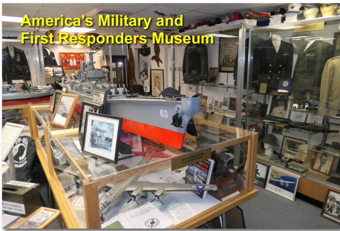
America's Military and First Responders Museum