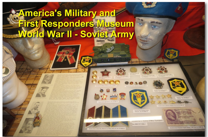
America's Military and First Responders Museum World War II - Soviet Army