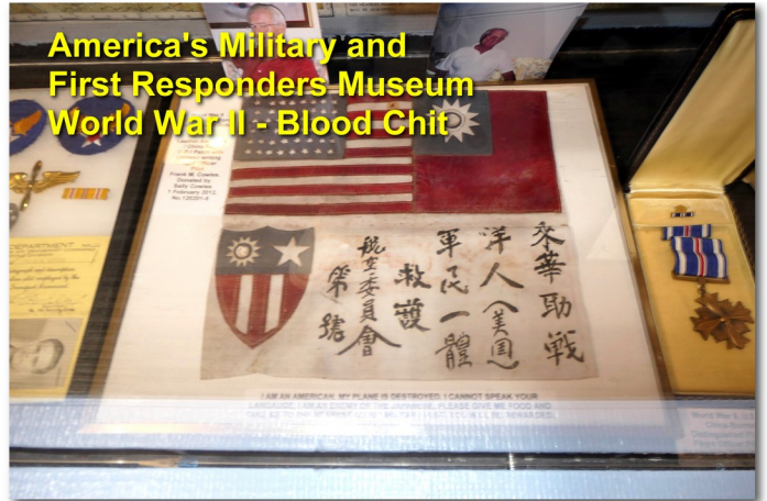
America's Military and First Responders Museum World War II - Blood Chit