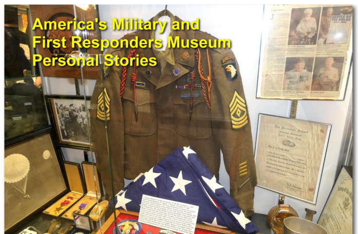
America's Military and First Responders Museum Personal Stories