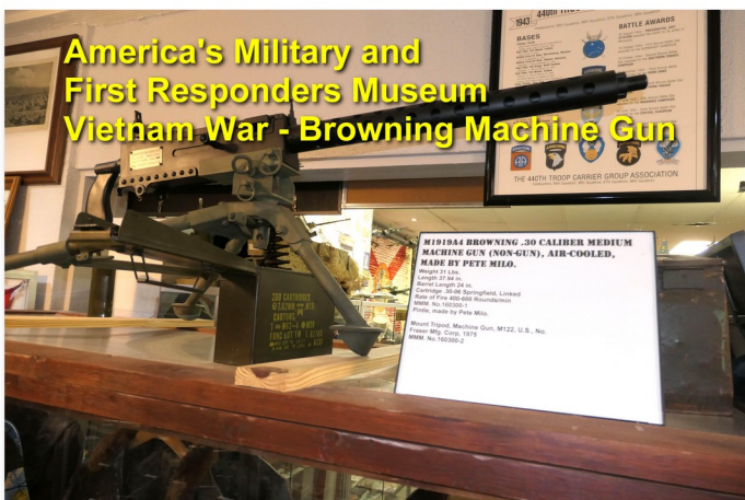
America's Military and First Responders Museum Vietnam War - Browning Machine Gun