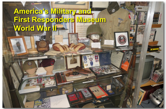
America's Military and First Responders Museum World War II