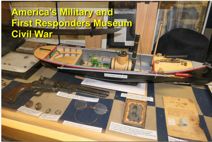
America's Military and First Responders Museum Civil War