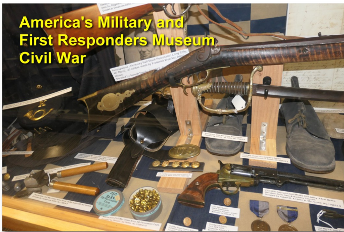
America's Military and First Responders Museum Civil War