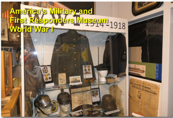
America's Military and First Responders Museum World War I