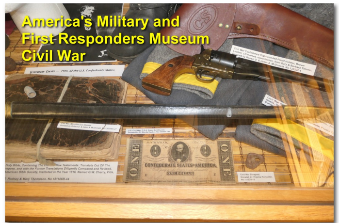
America's Military and First Responders Museum Civil War