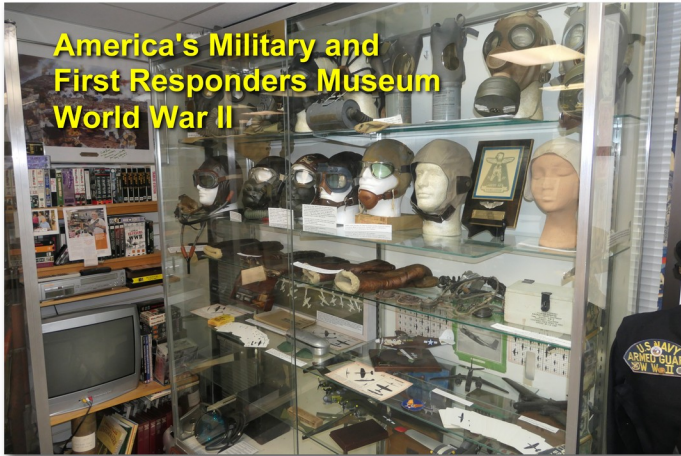
America's Military and First Responders Museum World War II