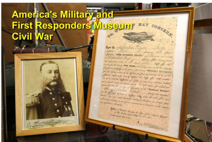
America's Military and First Responders Museum Civil War