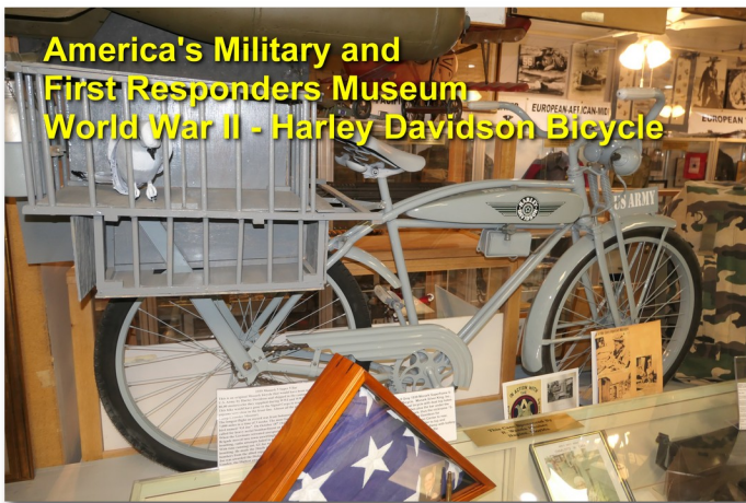
America's Military and First Responders Museum World War II - Harley Davidson Bicycle