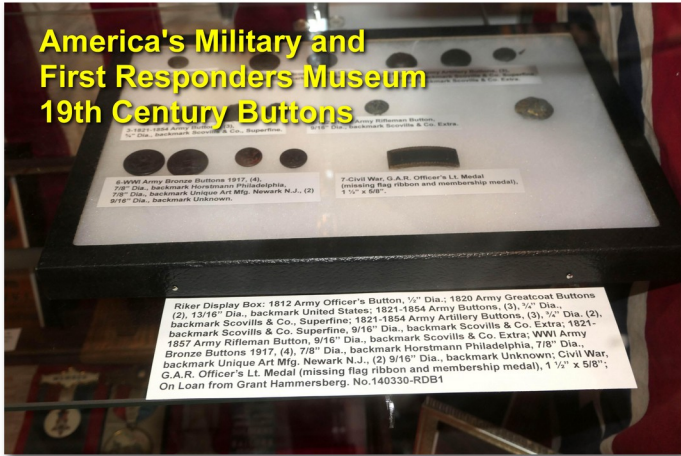
America's Military and First Responders Museum 19th Century Buttons