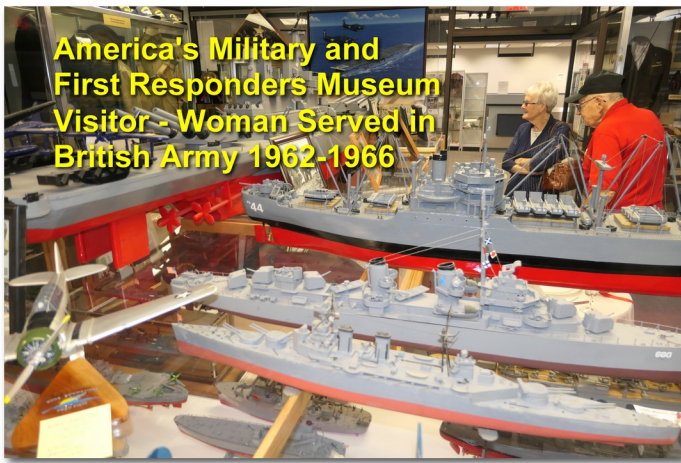
America's Military and First Responders Museum Visitor - Woman Served in British Army 1962-1966