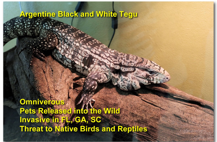
Argentine Black and White Tegu

Native to South and Central America. Invasive in Florida. Highly poisonous glands (bufotoxin) and toxic skin. Deadly to dogs and cats.