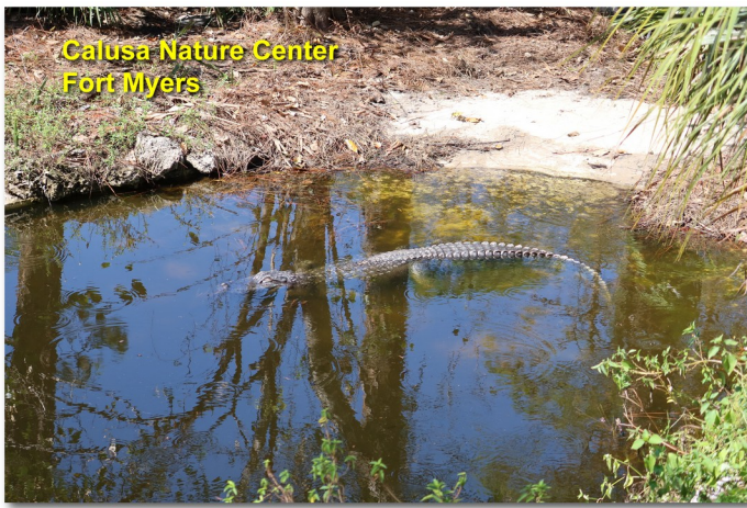
Calusa Nature Center Fort Myers