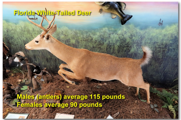
Florida White-Tailed Deer

Males (antlers) average 115 pounds Females average 90 pounds