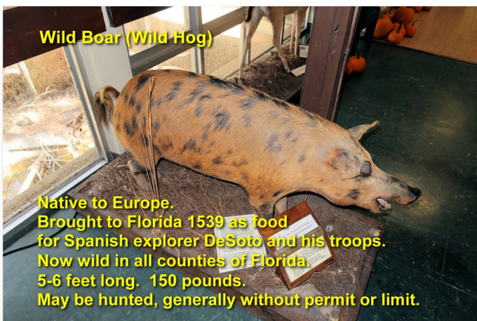
Wild Boar (Wild Hog)

Omnivorous Pets Released into the Wild Invasive in FL, GA, SC Threat to Native Birds and Reptiles