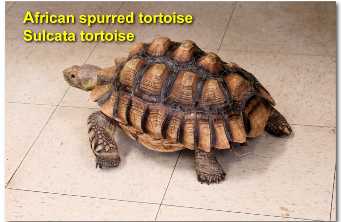
African spurred tortoise Sulcata tortoise

Florida State Freshwater Fish. Found in lakes and rivers. State record 17 pounds. Most popular game fish in North America.