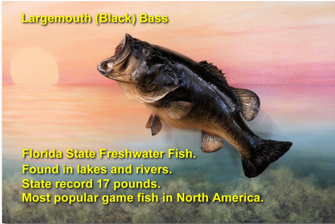
Largemouth (Black) Bass

Males (antlers) average 115 pounds Females average 90 pounds