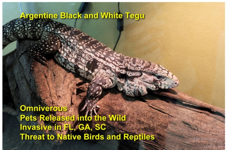
Argentine Black and White Tegu

Native to South and Central America. Invasive in Florida. Highly poisonous glands (bufotoxin) and toxic skin. Deadly to dogs and cats.