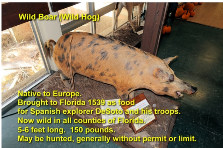
Wild Boar (Wild Hog)

Omnivorous Pets Released into the Wild Invasive in FL, GA, SC Threat to Native Birds and Reptiles