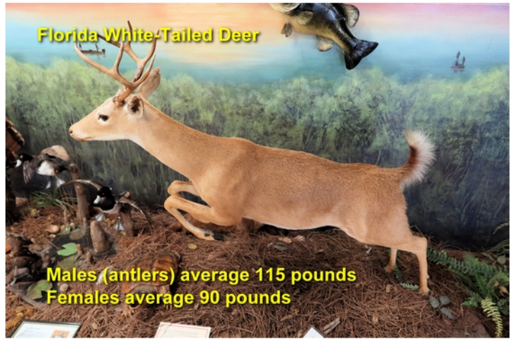
Florida White-Tailed Deer

Males (antlers) average 115 pounds Females average 90 pounds