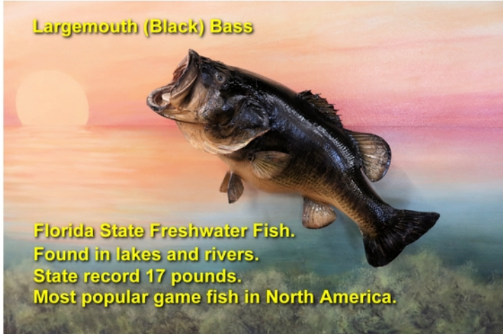
Largemouth (Black) Bass

Males (antlers) average 115 pounds Females average 90 pounds