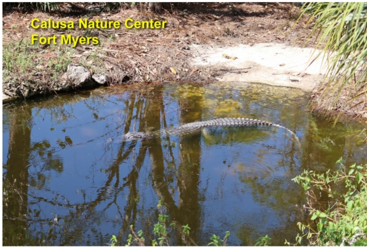
Calusa Nature Center Fort Myers