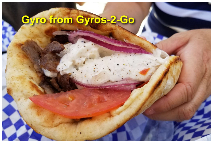
Gyro from Gyros-2-Go