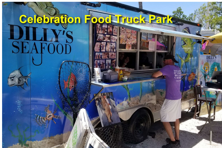
Celebration Food Truck Park