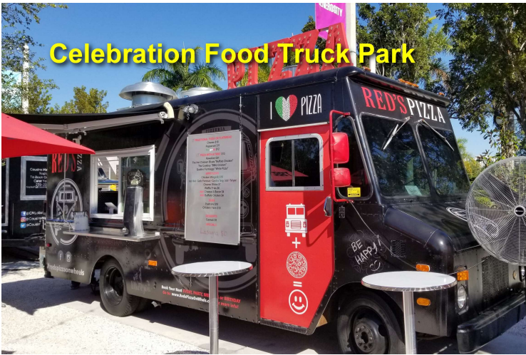
Celebration Food Truck Park