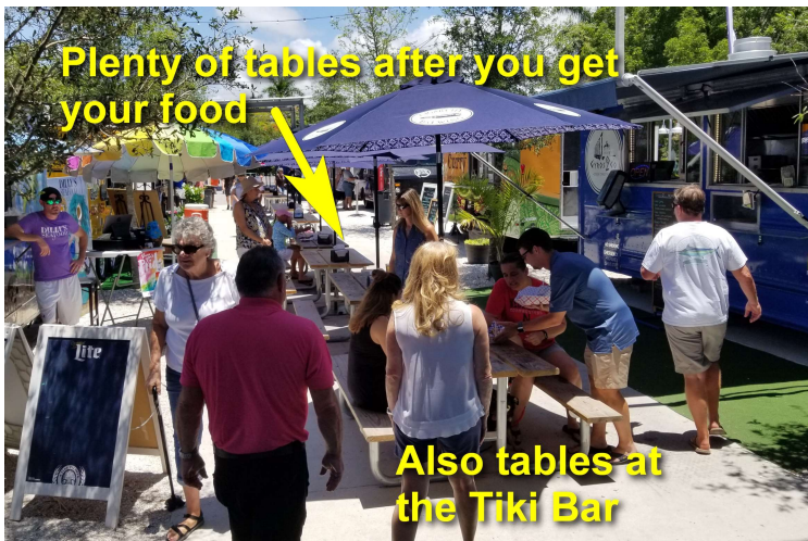
Plenty of tables after you get your food