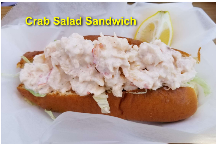
Crab Salad Sandwich