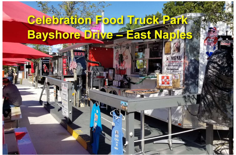
Celebration Food Truck Park Bayshore Drive – East Naples