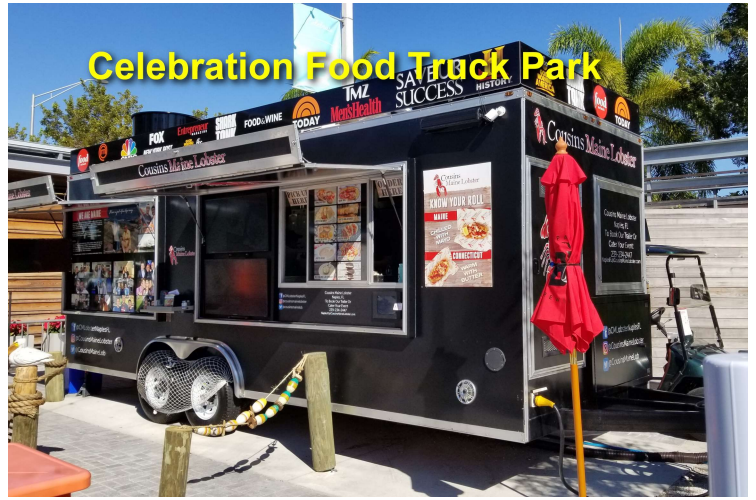
Celebration Food Truck Park