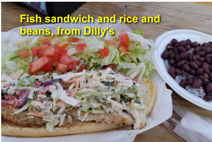
Fish sandwich and rice and beans, from Dilly's