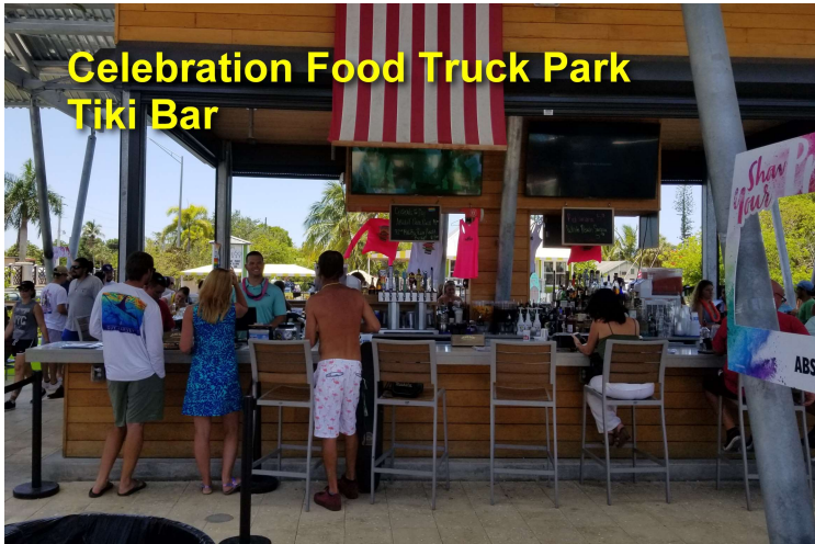
Celebration Food Truck Park Tiki Bar