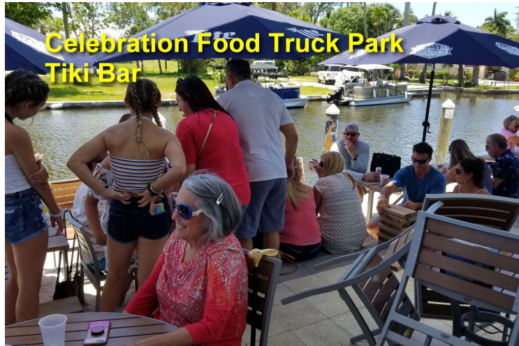
Celebration Food Truck Park Tiki Bar