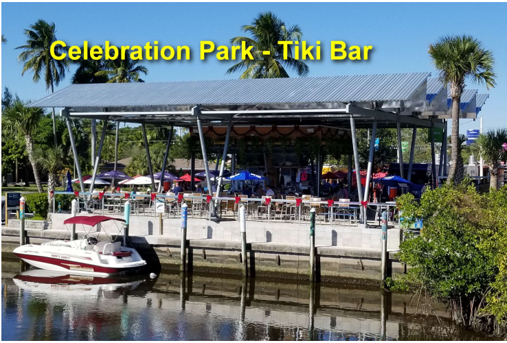
Celebration Park - Tiki Bar