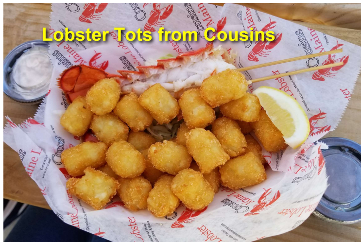
Lobster Tots from Cousins