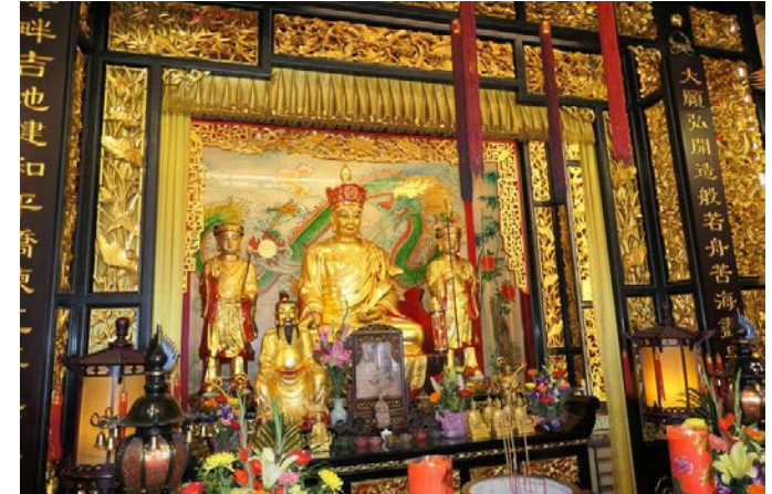
Left: Two temples – Old Mother Mazu Temple and Emperor Guan Temple (1796-1820).