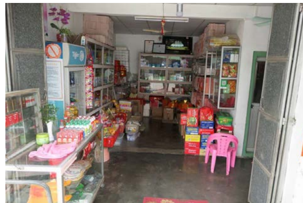
Left: The mother of one of the girls (pictured) owns this bakery.