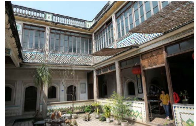
Chen Cihong's residence. Late 19 th and early 20 th c.

Some of the outbuildings have not been restored and are lived in by local people.