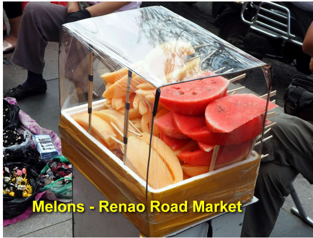
Melons - Renao Road Market