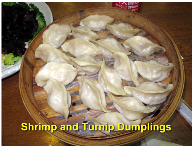
Shrimp and Turnip Dumplings