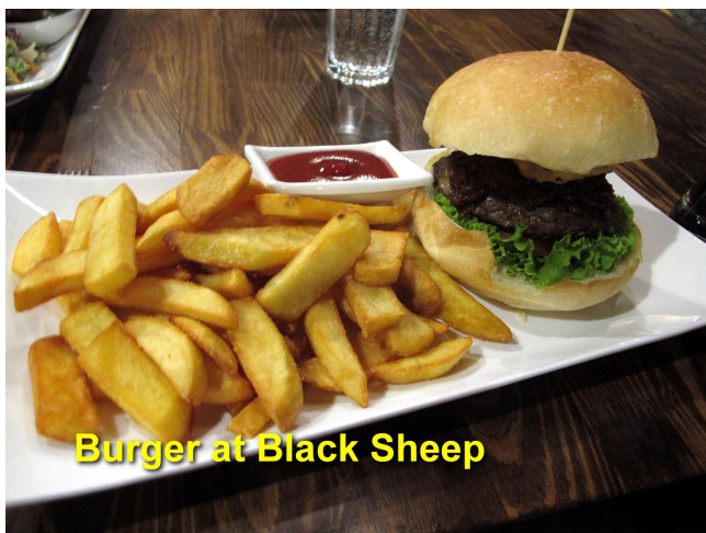
Burger at Black Sheep