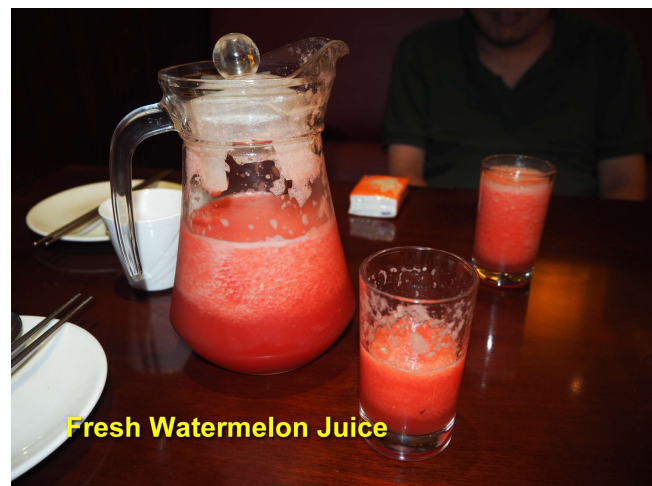
Fresh Watermelon Juice