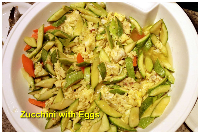
Zucchini with Eggs