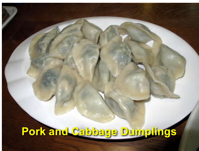
Pork and Cabbage Dumplings