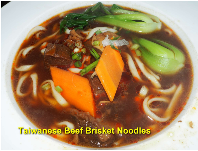
Taiwanese Beef Brisket Noodles