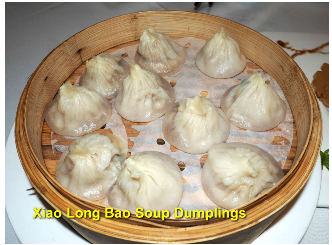
Xiao Long Bao Soup Dumplings