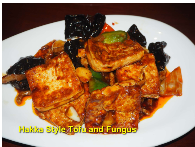
Hakka Style Tofu and Fungus