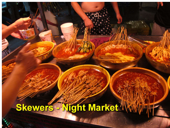
Skewers - Night Market