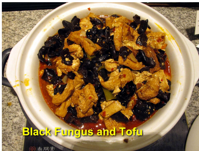
Black Fungus and Tofu