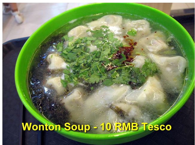
Wonton Soup - 10 RMB Tesco