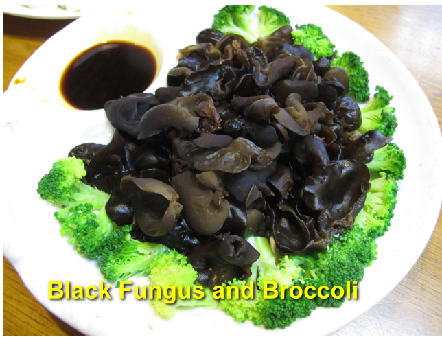
Black Fungus and Broccoli