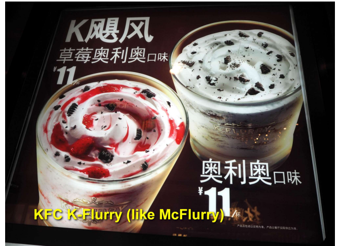
KFC K-Flurry (like McFlurry)