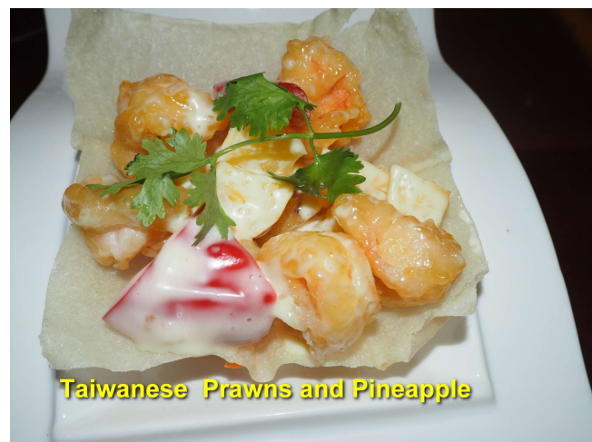
Taiwanese Prawns and Pineapple