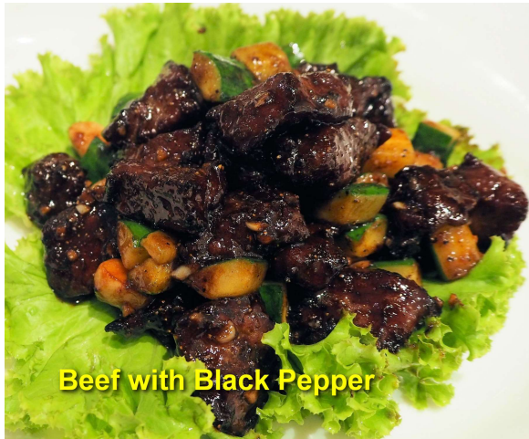
Beef with Black Pepper