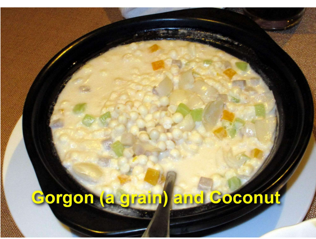
Gorgon (a grain) and Coconut