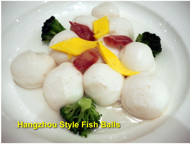
Hangzhou Style Fish Balls