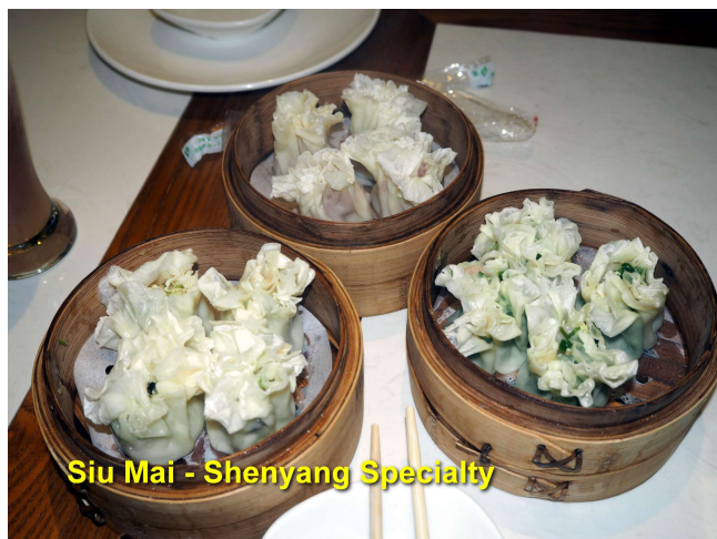
Siu Mai - Shenyang Specialty