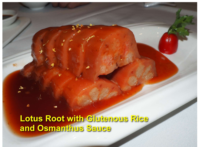
Lotus Root with Glutinous Rice and Osmanthus Sauce