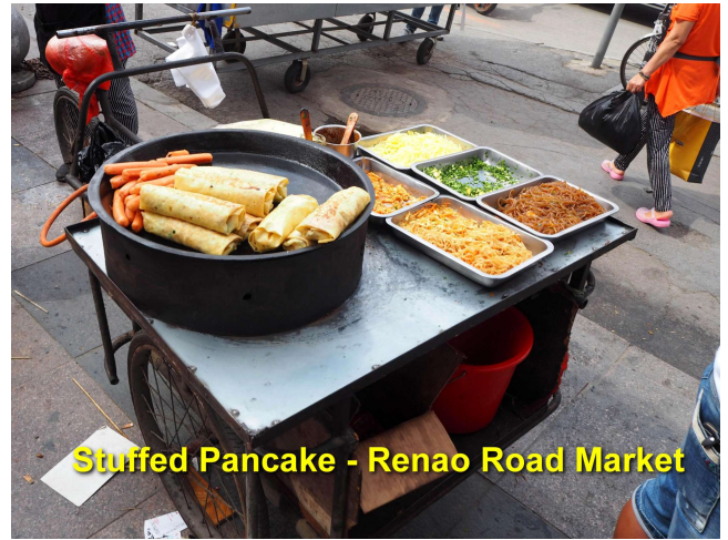
Stuffed Pancake - Renao Road Market