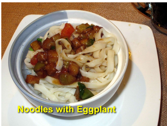
Noodles with Eggplant