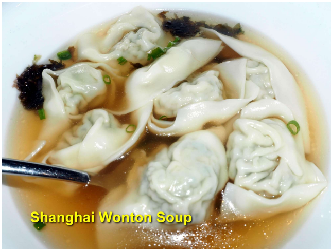
Shanghai Wonton Soup