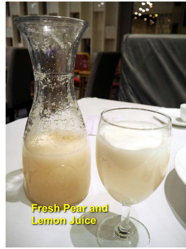
Fresh Pear and Lemon Juice