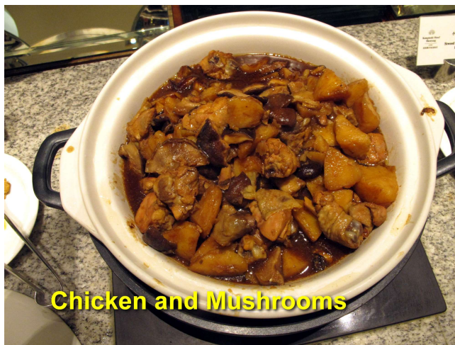
Chicken and Mushrooms