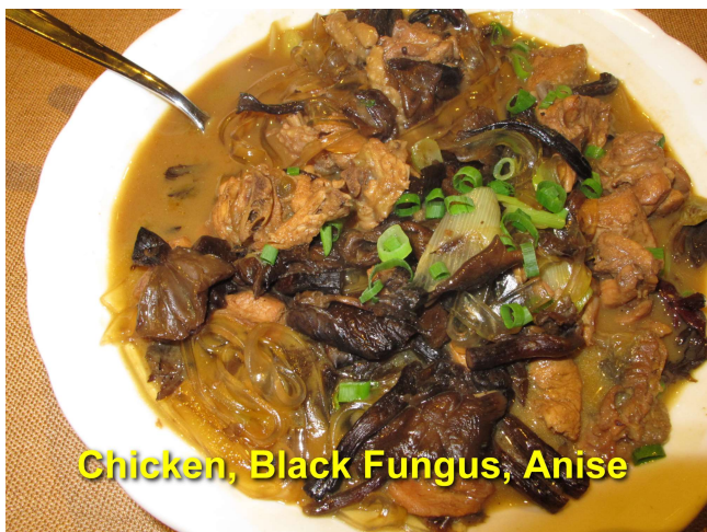
Chicken, Black Fungus, Anise