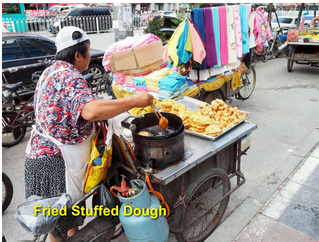
Fried Stuffed Dough