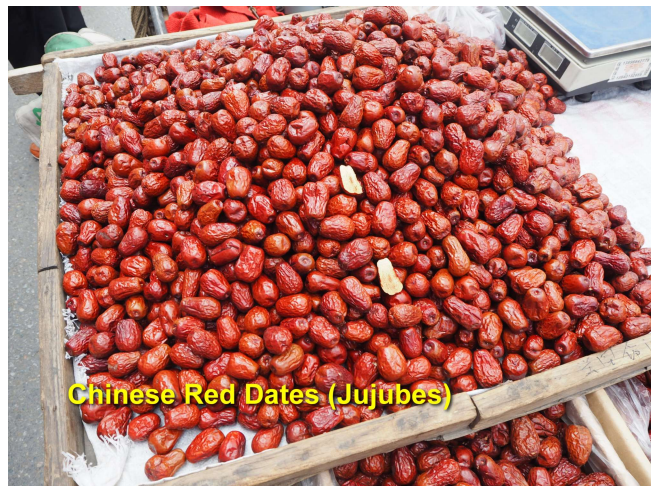
Chinese Red Dates (Jujubes)