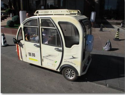
IMG_3326 Electric Tuk Tuk