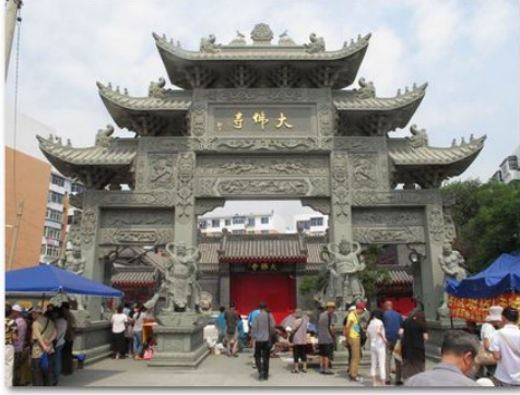
IMG_4151 Dafo Temple 10thC