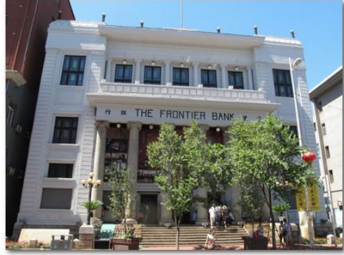
IMG_3274 Shenyang Finance Museum