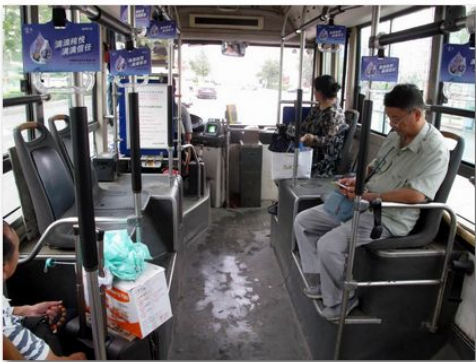
IMG_4183 City Bus We Took