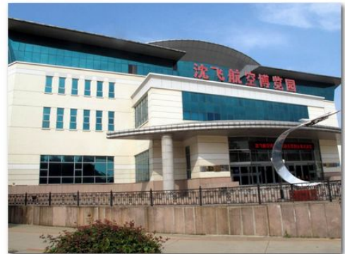
IMG_3901 Aviation Museum