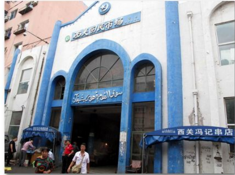
P8190349 Muslim Market