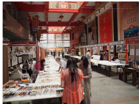
P8200548 North Market (Artists Market)