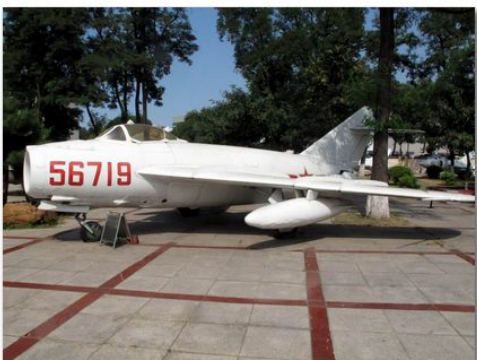
IMG_3903 F5 Fighter Aviation Museum