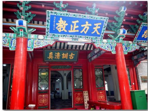
P8190372 South Mosque