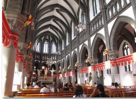
IMG_3325 Nanguan Catholic Church