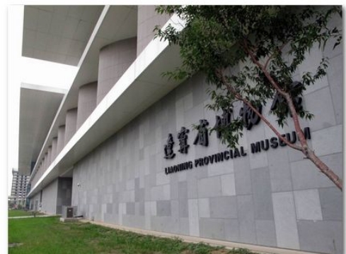
IMG_4239 Liaoning Provincial Museum