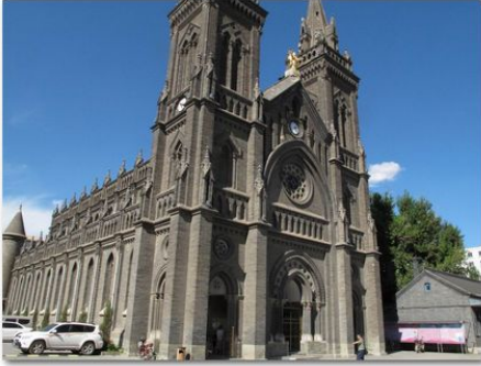
IMG_3322 Nanguan Catholic Church