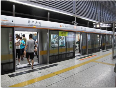
IMG_3354 Shenyang Metro