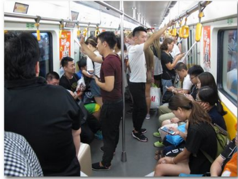
IMG_3359 Shenyang Metro