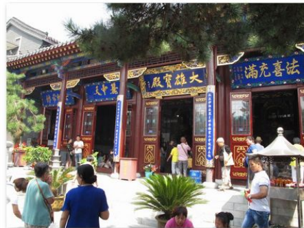
IMG_4061 Banruo Temple 1684