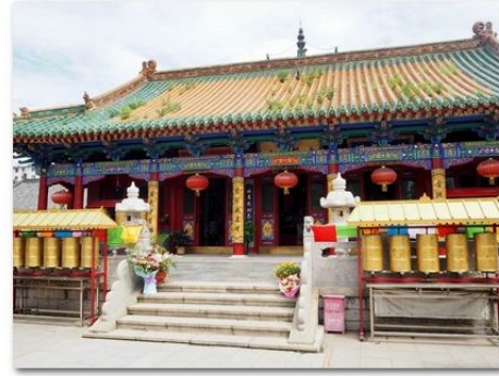
P8200519 Shisheng Huang Temple 17thC

Public transport was good and easy to use if you spoke Chinese. The metro (subway) was easy even with just English. Taxis were about US$1.50 to $2.00 almost anywhere in town, US$10 to the airport. Buses were 1RMB (16 US cents) anywhere. We took taxis and buses daily, metro a few times. Metro subway 2RMB (25 cents). One time we kept hailing taxis with no luck and an (unlicensed) electric tuk-tuk stopped and said US$1.50 to our hotel. Photos below: