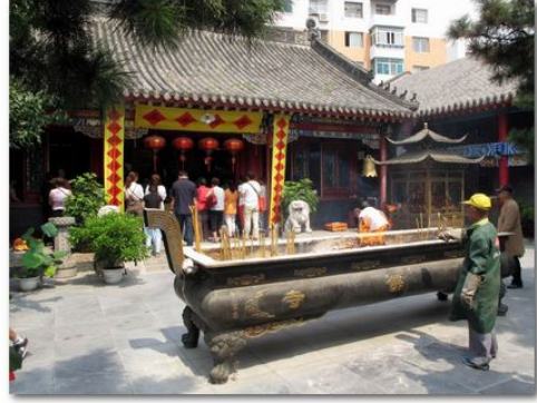
IMG_4172 Dafo Temple 10thC