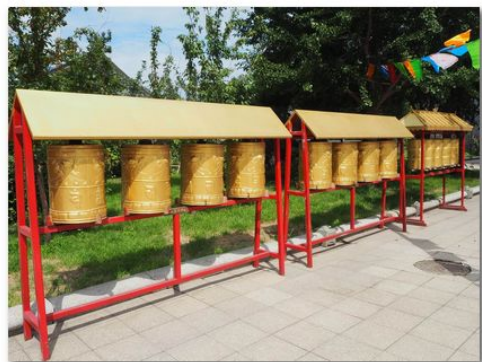
P8200499 Shisheng Huang Temple 17thC