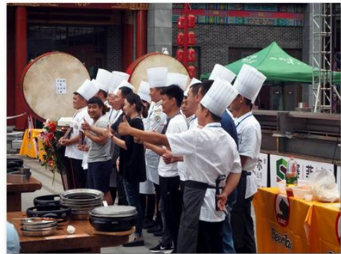
P8190393 BBQ Championship