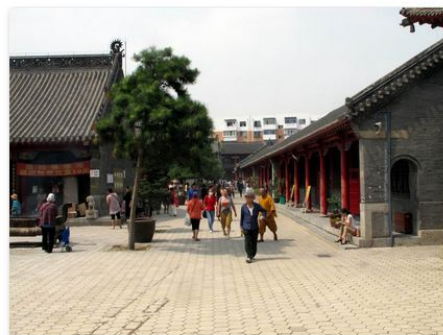
IMG_4141 Cien Temple 10thC