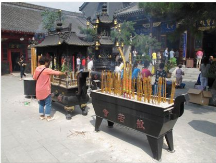
IMG_4010 Banruo Temple 1684