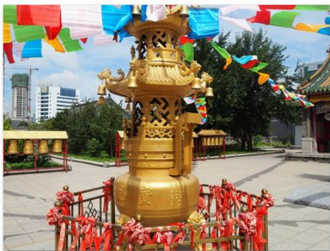
P8200497 Shisheng Huang Temple 17thC