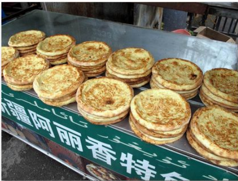
P8190350 Muslim Market