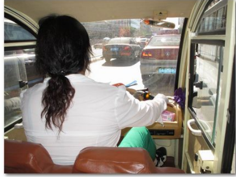
IMG_3330 Electric Tuk Tuk