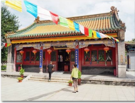
P8200500 Shisheng Huang Temple 17thC