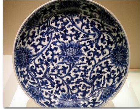
IMG_4271 Porcelain Liaoning Provincial Museum