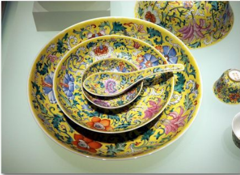
MG_4270 Porcelain Liaoning Provincial Museum