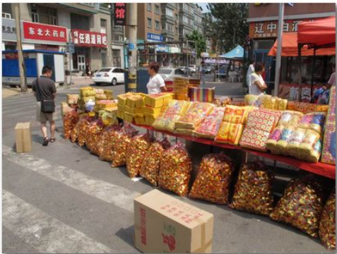
IMG_3828 Hungry Ghost Festival