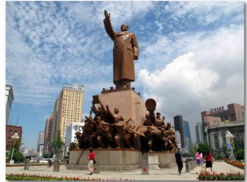
IMG_3530 Mao Statue Zhongshan Square