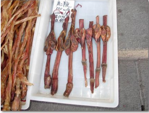
IMG_3158 Guess What This Is