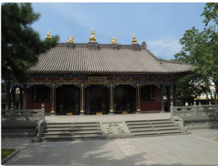
IMG_3840 North Pagoda