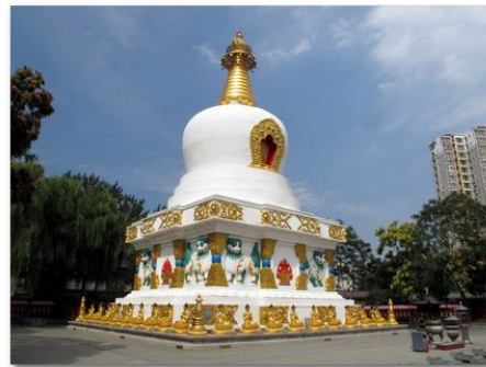
IMG_3848 North Pagoda