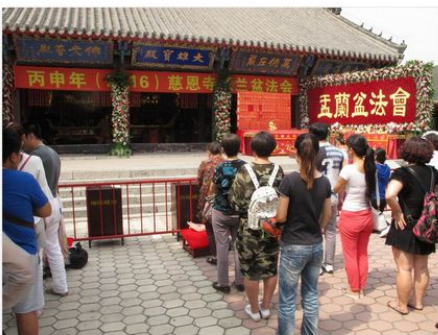
IMG_4102 Cien Temple 10thC