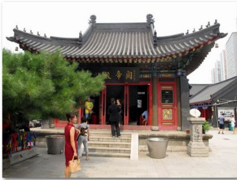
IMG_4189 Taiqing Taoist Palace 1633