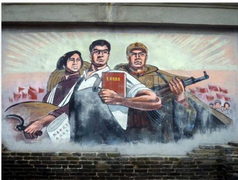
P8190439 Communist Factory Mall