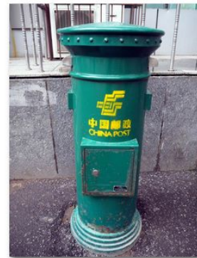
P8190380 China Post Box