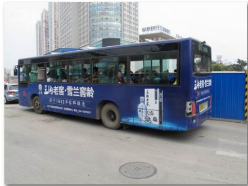
IMG_4182 City Bus We Took