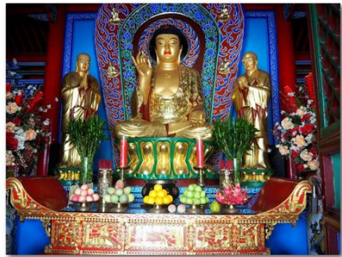
P8190415 Changan Temple