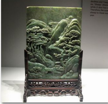
IMG_4269 Jade Liaoning Provincial Museum