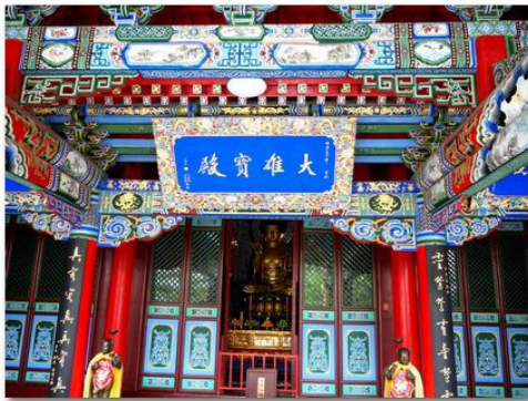
P8190411 Changan Temple