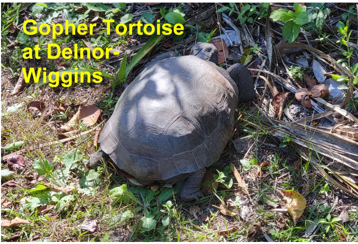
Gopher Tortoise at Delnor- Wiggins