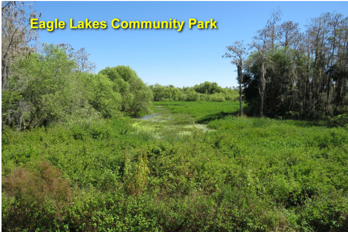
Eagle Lakes Community Park