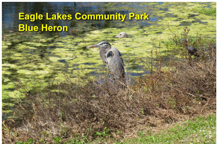
Eagle Lakes Community Park Blue Heron