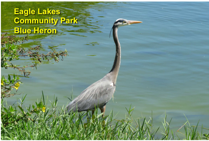
Eagle Lakes Community Park Blue Heron