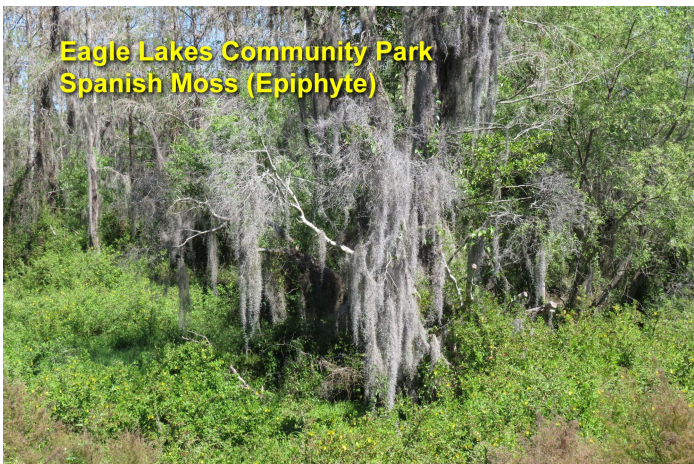
Eagle Lakes Community Park Spanish Moss (Epiphyte)