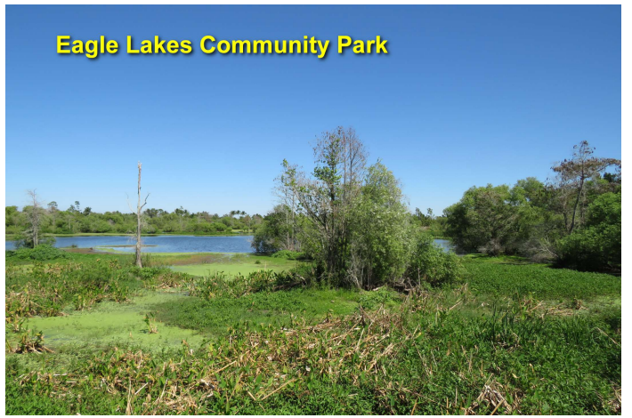
Eagle Lakes Community Park