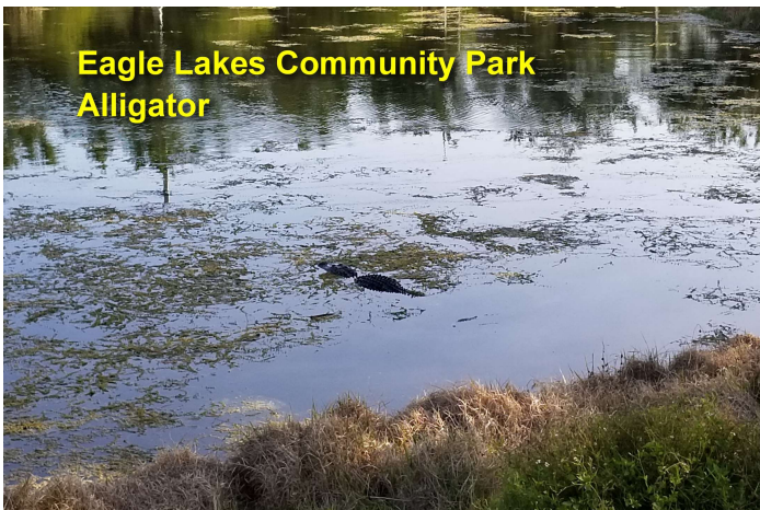
Eagle Lakes Community Park Alligator