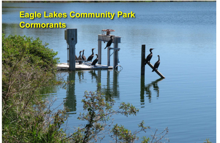
Eagle Lakes Community Park Cormorants