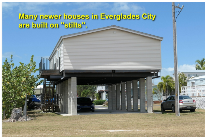
Many newer houses in Everglades City are built on "stilts".