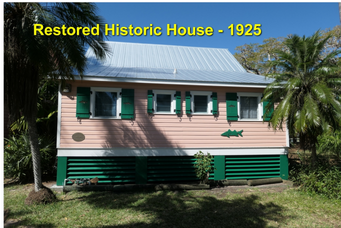
Restored Historic House - 1925