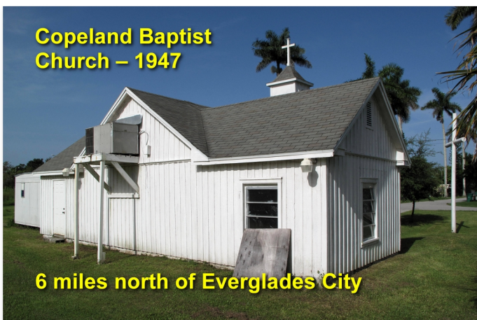
6 miles north of Everglades City