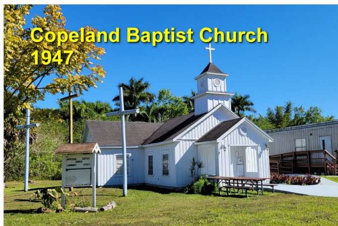
Copeland Baptist Church 1947