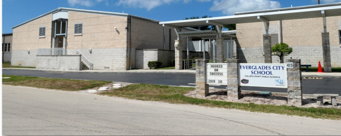
Everglades City School Collier County Public Schools 196 Students in Grades Pre-K to 12.