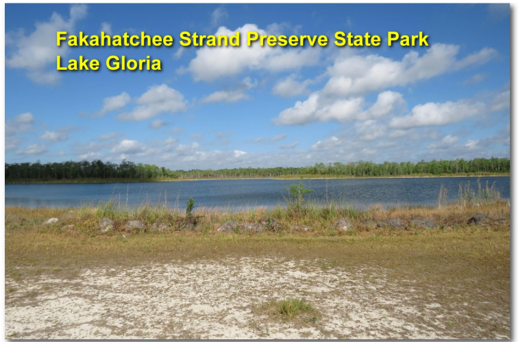
Fakahatchee Strand Preserve State Park Lake Gloria