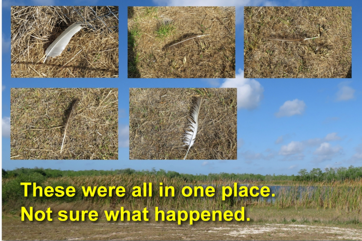
These were all in one place. Not sure what happened.