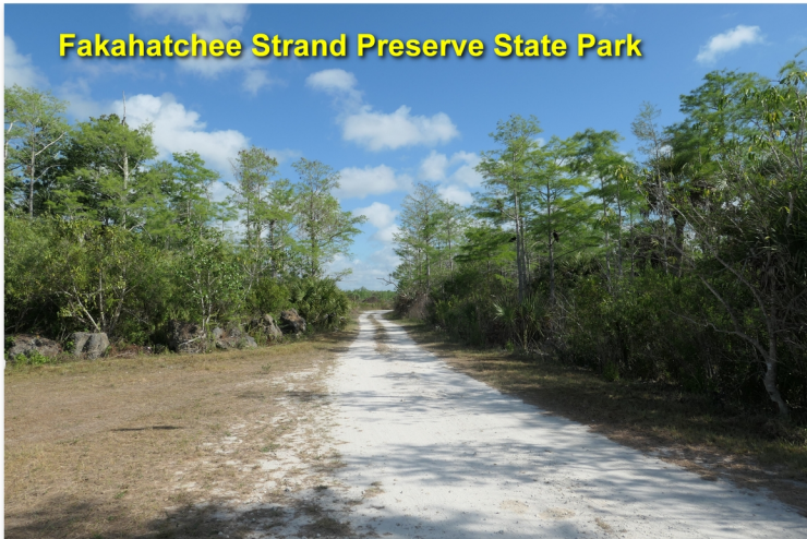
Fakahatchee Strand Preserve State Park