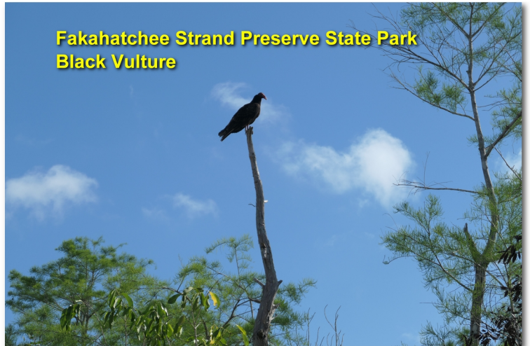
Fakahatchee Strand Preserve State Park Black Vulture