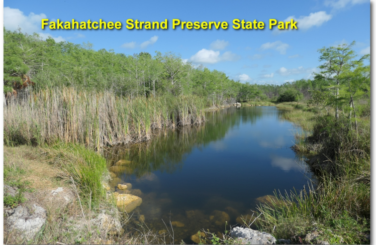
Fakahatchee Strand Preserve State Park