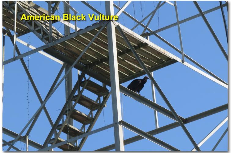
American Black Vulture