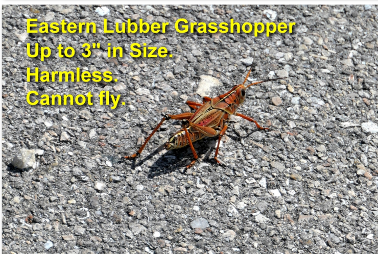
Eastern Lubber Grasshopper Up to 3" in Size. Harmless. Cannot fly.