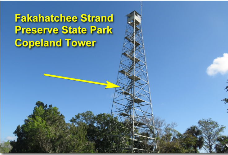
Fakahatchee Strand Preserve State Park Copeland Tower