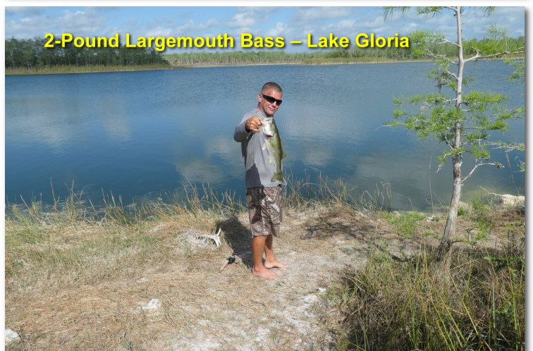
2-Pound Largemouth Bass – Lake Gloria